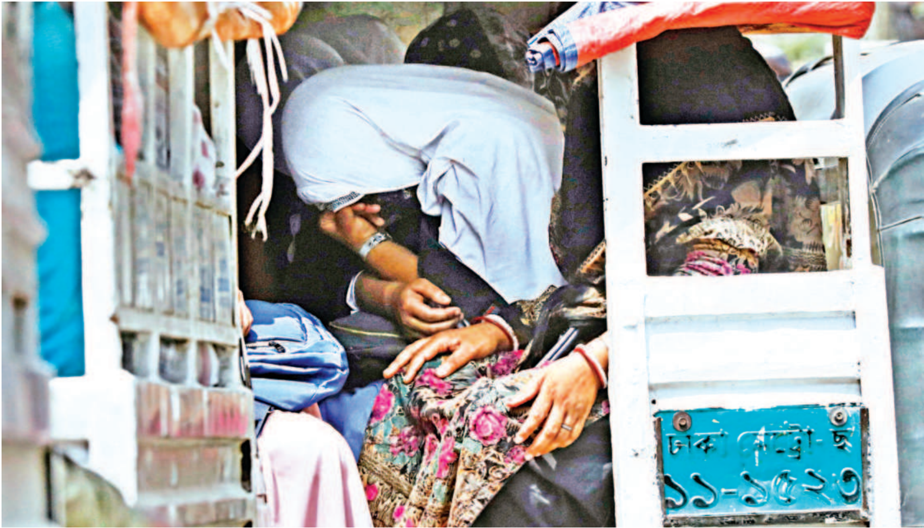
Every day, Dhaka's traffic takes its toll on the commuters, as everyone has to suffer through the long hours, accompanied by the swelter. The usual scene is evident inside this Laguna, in which the passengers are trying their best to deal with yet another day of misery. This photo was taken from Green Road.