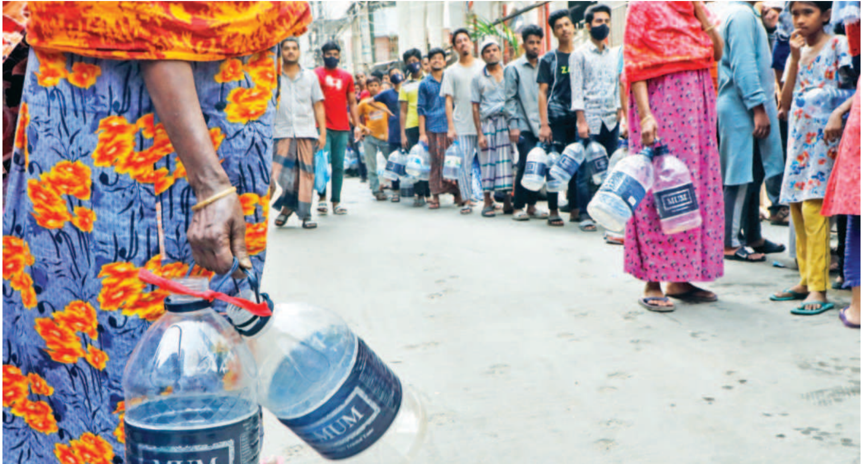
Holding empty bottles, people wait in line in front of West Tejpuribazar Jame Mosque to get water. Residents of West and East Tejpuribazar, Green Road and Farmgate areas gather there to get drinking water from the mosque's tube-well. Though all of them have Wasa's supply at home, they say Wasa water is okay for bathing and other uses, but not for drinking. This newspaper published a report on the issue on March 26, where the authorities concerned assured that they will look into the issue. However, it's been more than 10 days, and the tap water remains smelly, while the queue for drinkable water continues to get bigger. This photo was taken yesterday afternoon.