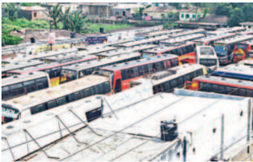
Buses lie idle at Kamarpara bus stand yesterday.

But it is still unclear who actually called the strike, the owners or the transport workers, as different workers are contradicting each other's statements. Some said the owners called it, while others were saying that the workers