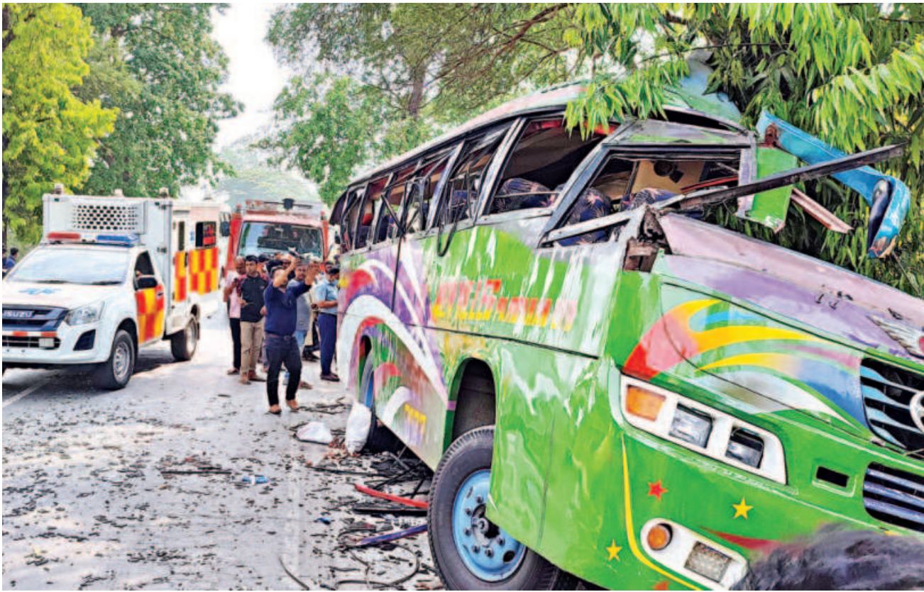
Fire service officials and law enforcers continue rescue operation after this bus hit a roadside tree yesterday afternoon, killing three people and injuring 20. The accident happened as the driver lost control over the steering on Dhaka-Aricha highway in Muljan area.

He died at Dhaka Medical College Hospital, said police.