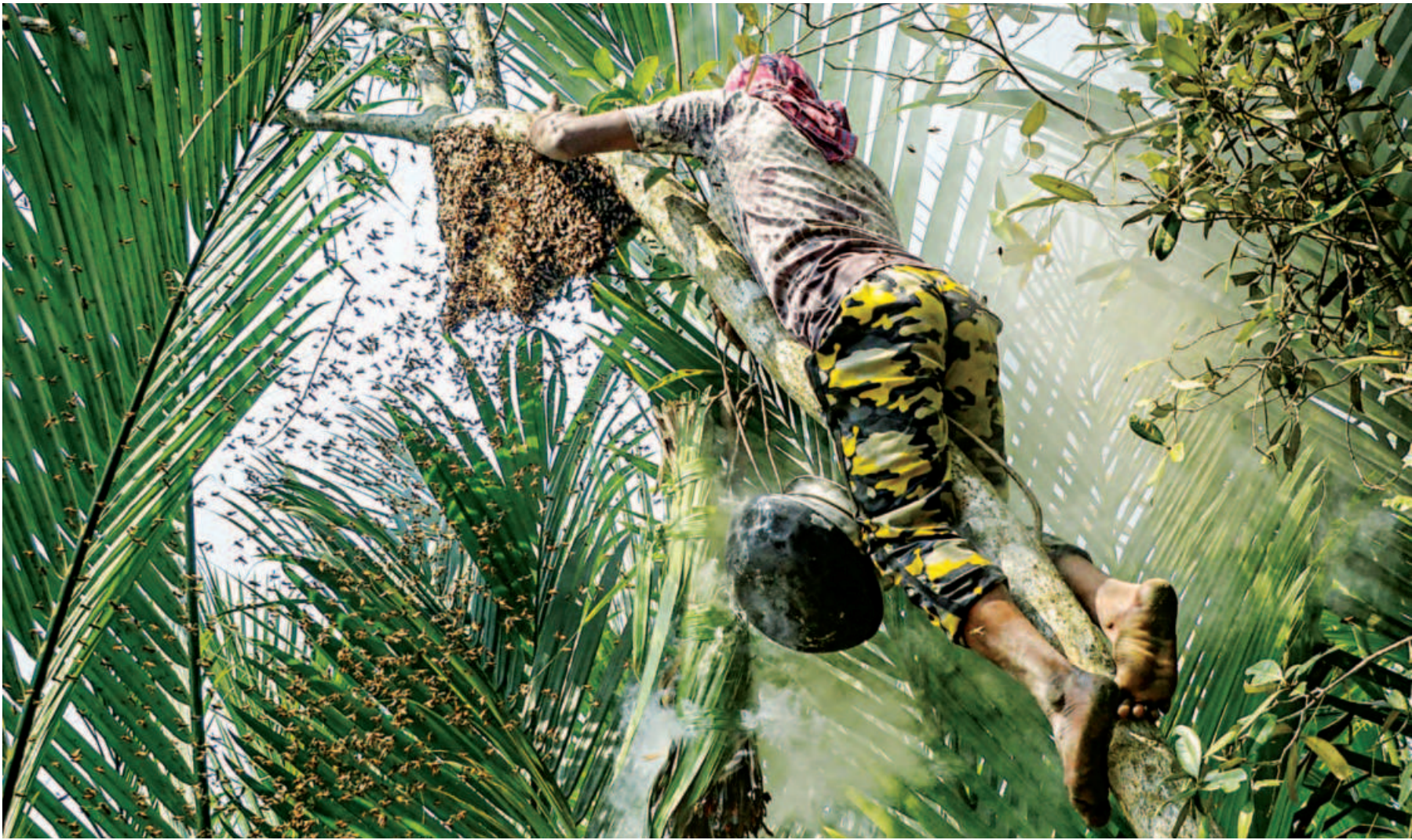
A man harvests honey in the Sundarbans recently after the forest department permitted honey collection between March 15 and May 30. Of myriad varieties of honey, those extracted from Kolshi and Goral flowers are most sought-after in the country.