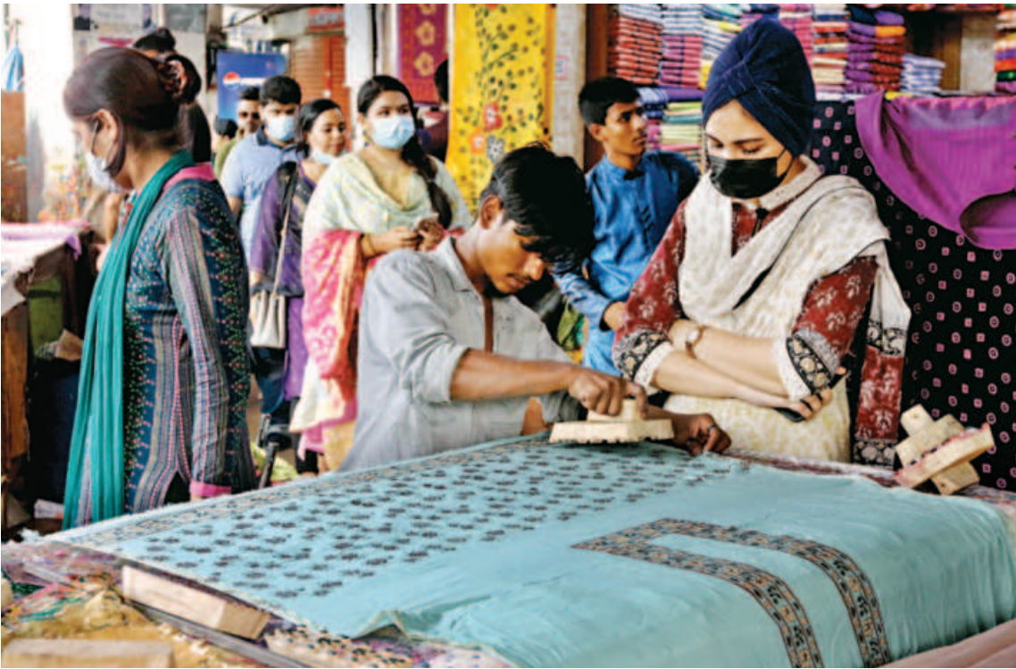
A man prints blocks on a piece of cloth while a woman watches in the capital’s New Market yesterday. As people were not able to properly celebrate Eid throughout the pandemic, this one holds special value for customers and traders alike. Tailors, designers and sellers are working twice as hard to cater to the growing demands as they expect their biggest sales since 2020.