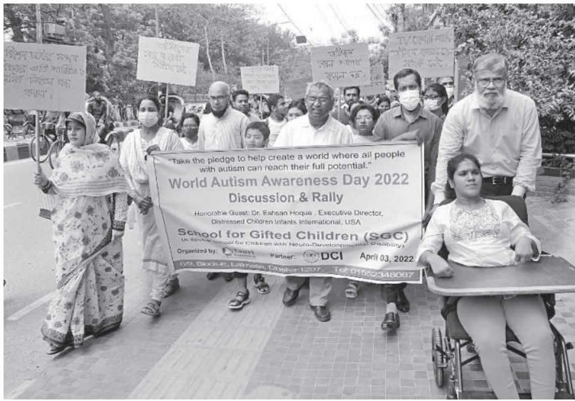
With a pledge to help create a world where all people with autism can reach their full potential, a group of people under the banner of "School for Gifted Children" brought out a rally on Saat Masjid Road in Dhanmondi yesterday.