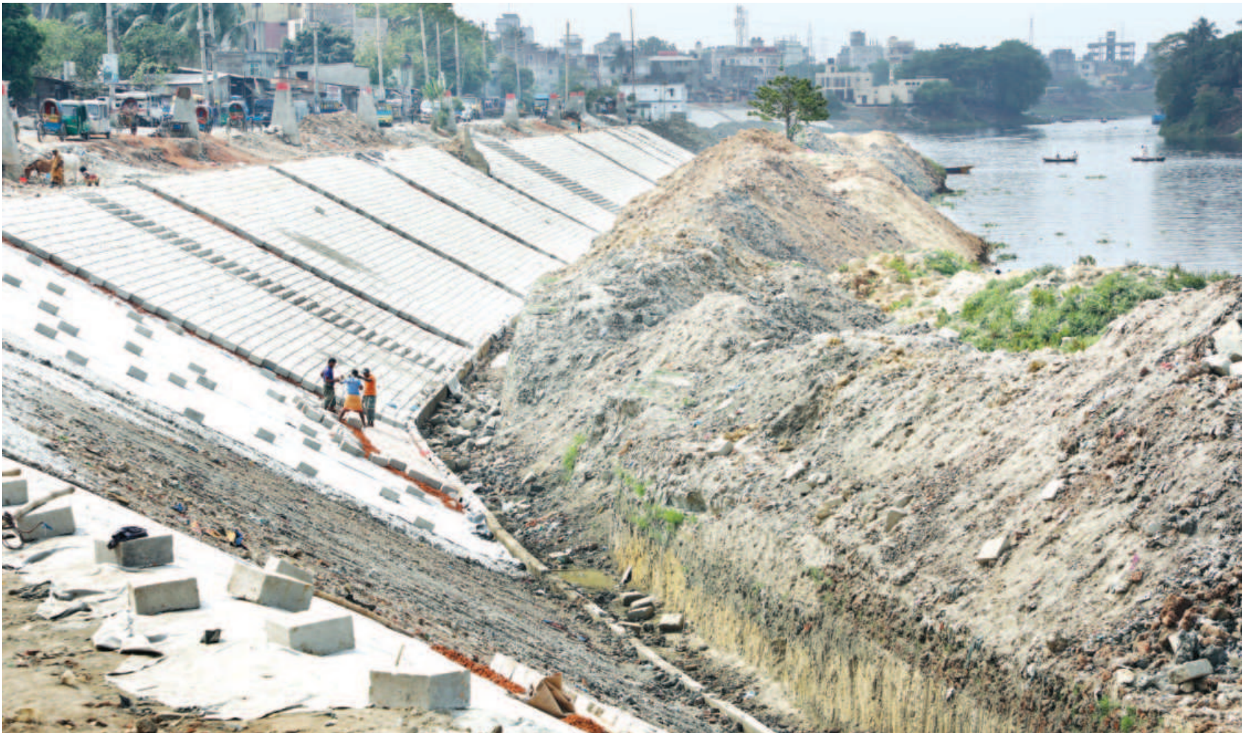
The BIWTA is building embankments along both banks of the Turag river to prevent erosion and flood damage. Walkways are also being constructed there. The photo was taken at Diabari in the capital's Mirpur on Thursday.