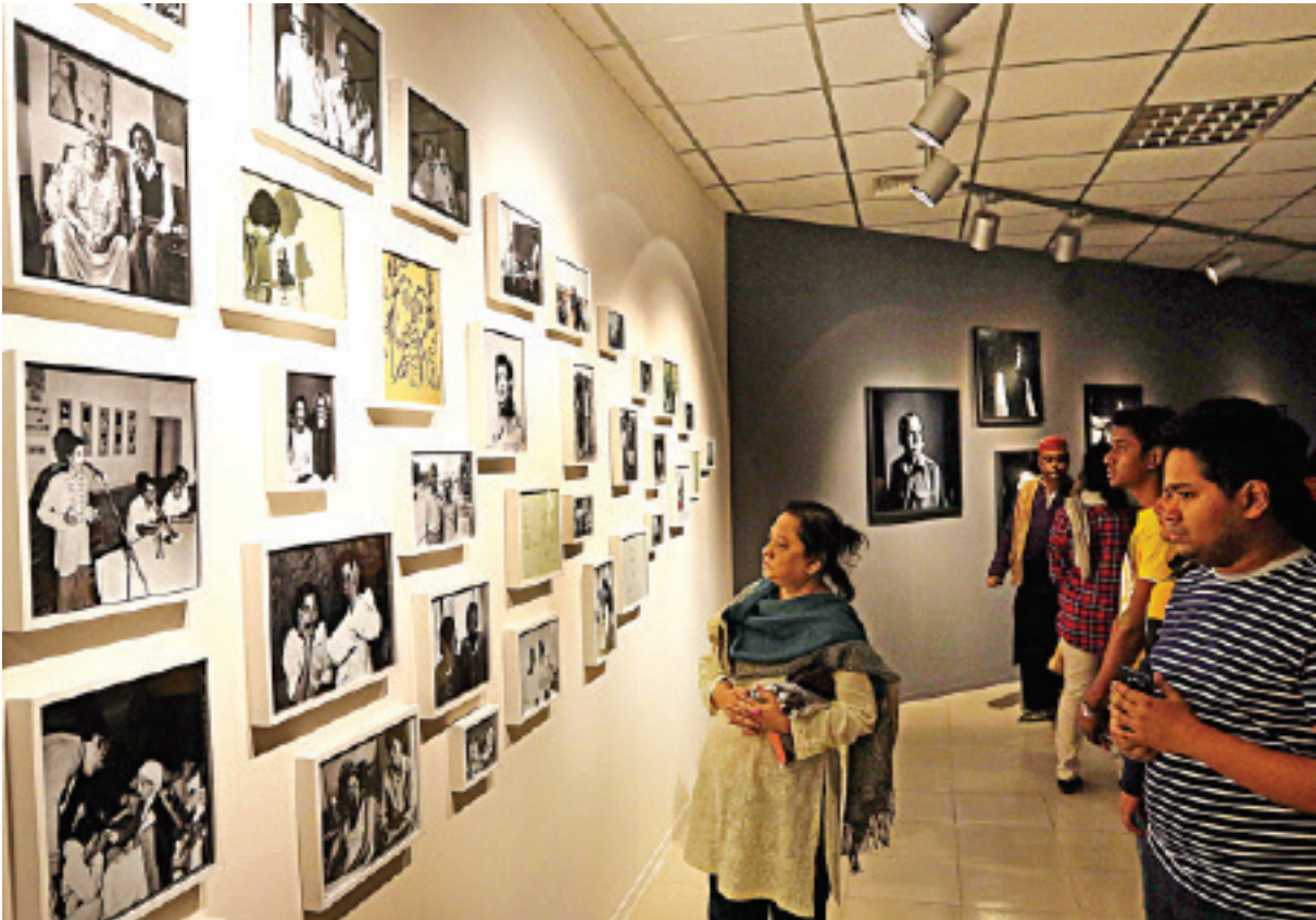
Visitors look at photos at Chhobi Mela in the capital's Shilpakala Academy yesterday.

"An attempt is on to turn our government institutions into extensions of that of the neighbouring country," he said, adding, "As a result, political, financial and cultural aggression in Bangladesh has taken a serious turn."