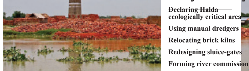
A brick kiln near the river bank.