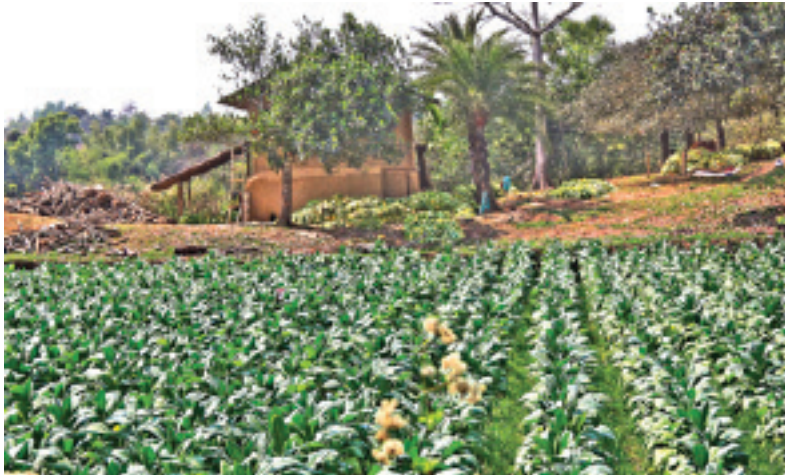
A rapid increase of tobacco farming near the river.