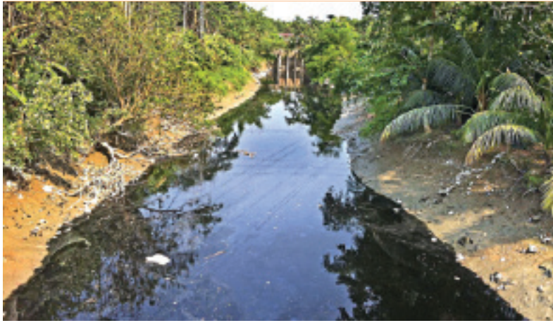
Industrial discharges flowing into the river through a canal.