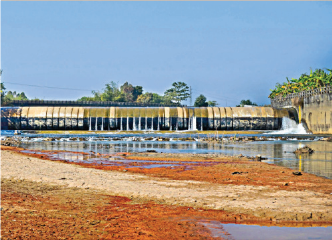
A rubber dam on the upstream of the Halda disrupting its natural flow. The photo was taken recently.