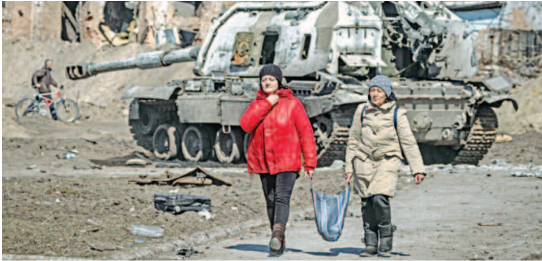
Residents walk past a damaged Russian tank in the northeastern city of Trostianets, which Ukrainian forces recaptured this week. The photo was taken on Tuesday.