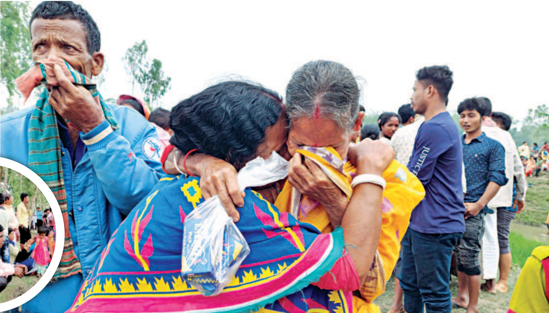
This year’s “Kannakatir Mela” took place after two years due to the pandemic. This deprived families, separated by the border, from meeting each other at the only place where they get to be together. They broke down in tears as soon as they met at yesterday’s fair at Ghongagachhi border in Lalmonirhat’s Gorol union.