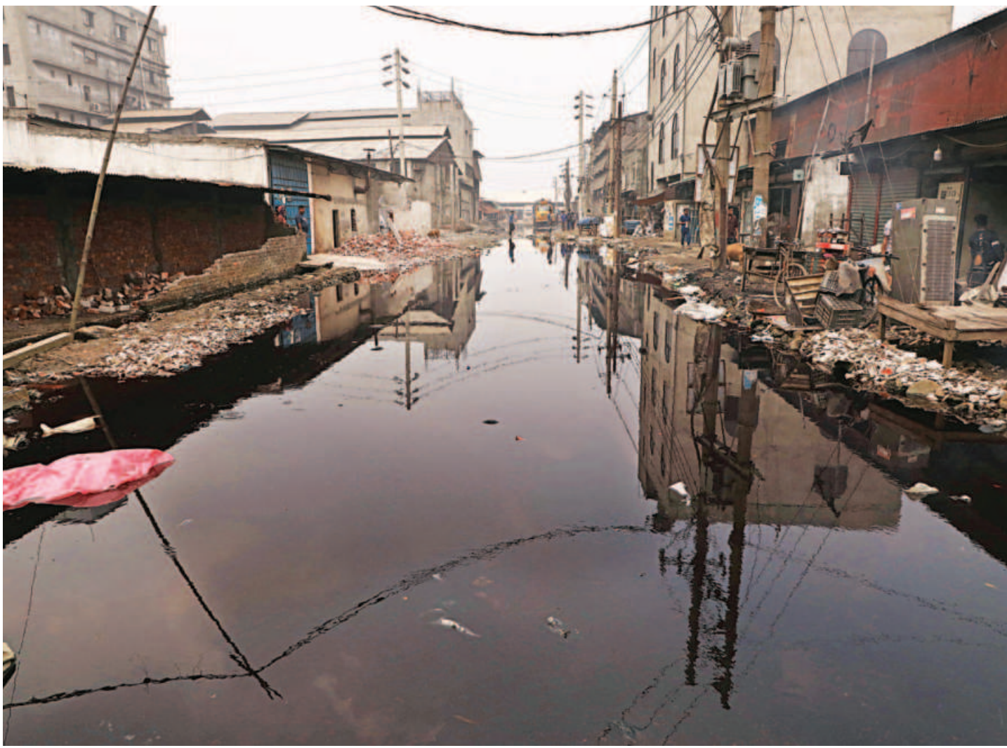
What looks like a polluted canal is actually a street in the capital's Shyampur area. It has long been under dark water discharged into clogged drains by fabric dyers. The photo was taken recently.