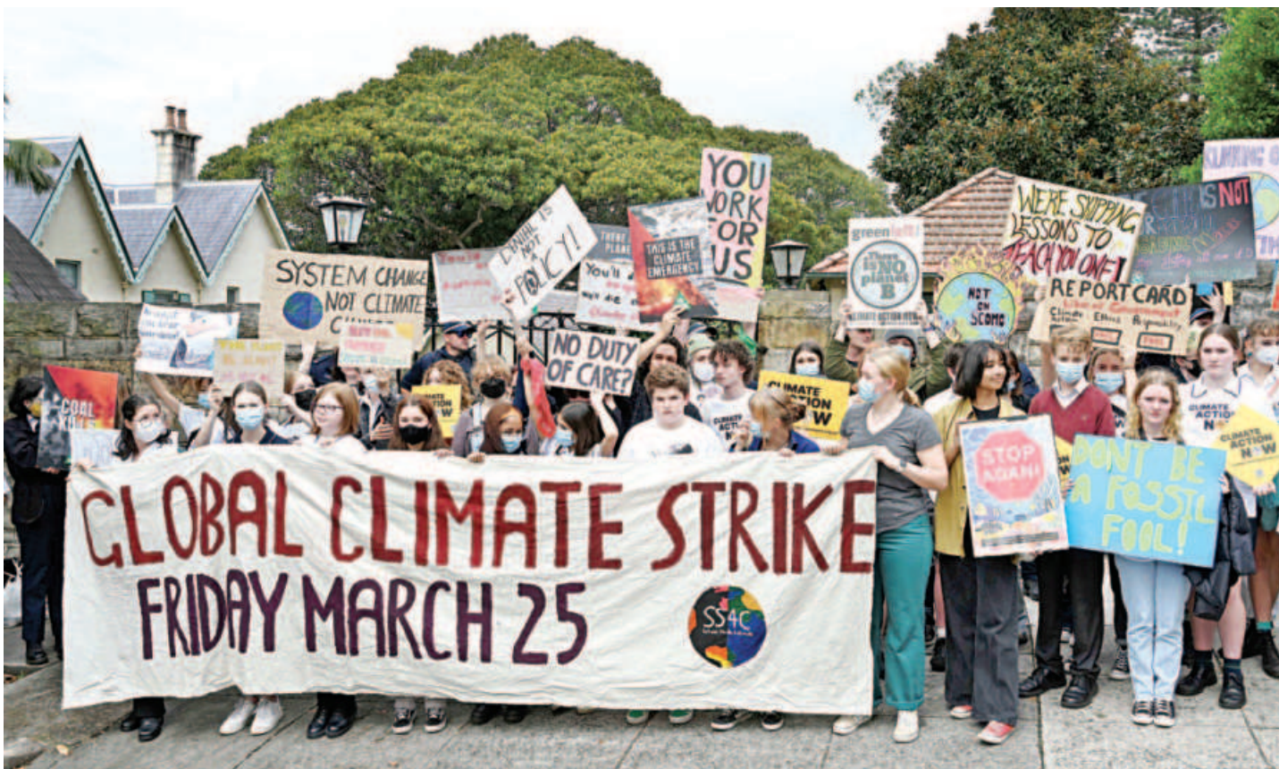
Schoolchildren shout slogans as they march towards the prime minister's house in Sydney, Australia yesterday, during a strike and protest by students highlighting inadequate progress to address climate change.

The speaker said in a live telecast that he adjourned the proceedings in order to conform with a longstanding tradition to refrain from carrying out parliamentary business on the first day of a session convened shortly after the death of an MP.