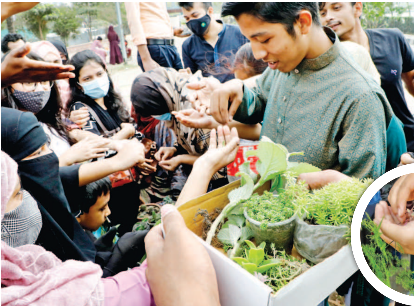
Members of Bangladesh Plant Lovers' Society and Bangladesh Cactus Lovers' Society came together in front of Gulshan's Police Plaza to exchange plants, recognise top gardeners and share pleasantries among themselves.

The fair will open at 3:00pm every day and will continue till 8:00pm.