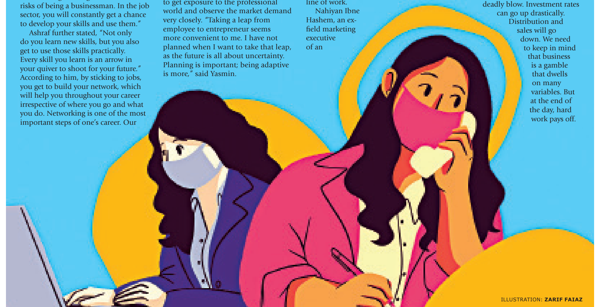
ILLUSTRATION: ZARIF FAIAZ

can go up drastically. Distribution and sales will go down. We need to keep in mind that business is a gamble that dwells on many variables. But at the end of the day, hard work pays off.