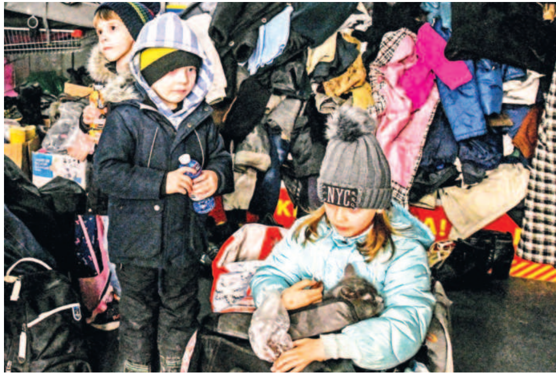
Children rest at a collecting point after fleeing from Mariupol in Zaporizhzhia, Ukraine. More than 3.6 million people have fled Ukraine since Russia's invasion, the UN said yesterday.