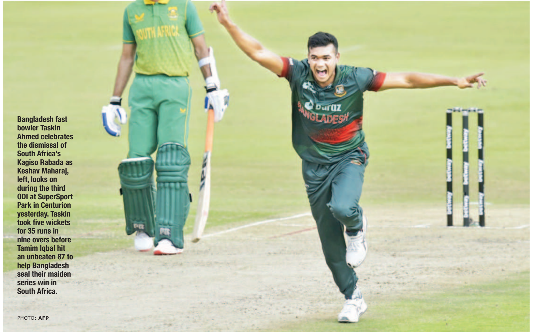
Bangladesh fast bowler Taskin Ahmed celebrates the dismissal of South Africa's Kagiso Rabada as Keshav Maharaj, left, looks on during the third ODI at SuperSport Park in Centurion yesterday. Taskin took five wickets for 35 runs in nine overs before Tamim Iqbal hit an unbeaten 87 to help Bangladesh seal their maiden series win in South Africa.