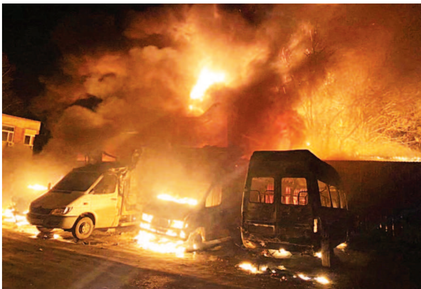
Cars and buildings are seen on fire after shelling, as Russia's invasion of Ukraine continues, in Mykolaiv, Ukraine, in this handout picture released yesterday.