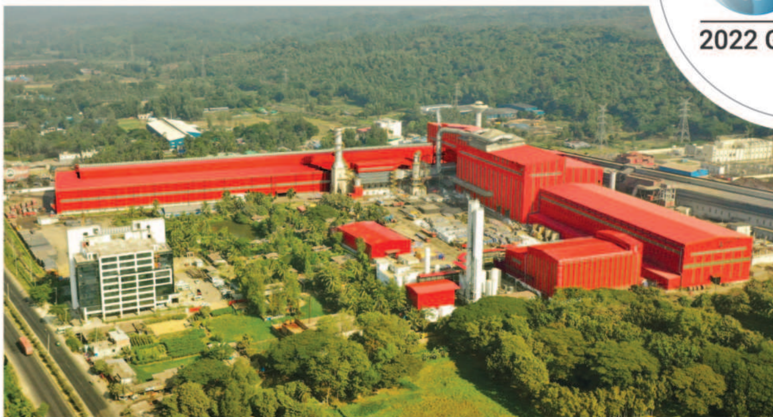
GPH's Quantum Electric Arc Furnace with Winlink Technology is a completely green, world class factory

There is not an abundance of drinking water available in the world. Only 3% of the Earth's available water is freshwater, with less than 1% of this being accessible. Therefore, protecting the quality of freshwater is of paramount importance, especially for a country like Bangladesh.