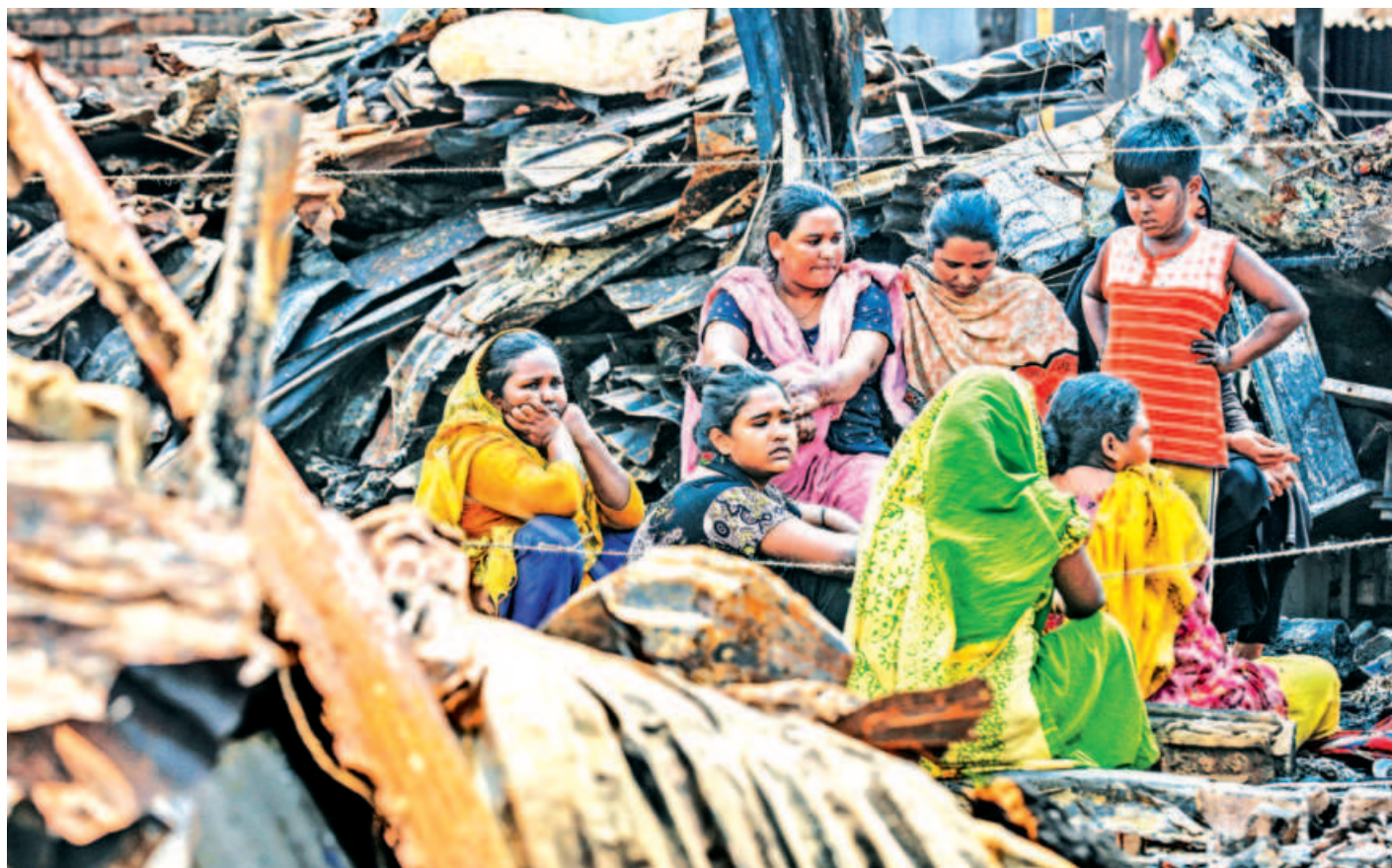
WHAT USED TO BE HOME ... Women sit amid the remains of the shanties gutted by a blaze in the capital's Kalyanpur area on Sunday night. Many others were seen wandering about the slum, clueless as to what the future holds. The photo was taken yesterday morning.

STAR HEALTH DESK Snoring is the noise people make while breathing during sleep. It is not usually a very serious illness, but it can be indicative of other conditions. It is also a nuisance for those you share the bed or room with. It may be a result of sleep deprivation. The condition happens when the air flow through the mouth or nose is hindered. There may be many reasons behind air flow being obstructed. Muscle tone decreases with age, causing airways to constrict. That's why snoring is more common in older people. It is also more common in men and those who are overweight. Alcohol consumption and certain medications which relax muscles may SEE PAGE 10 COL 1