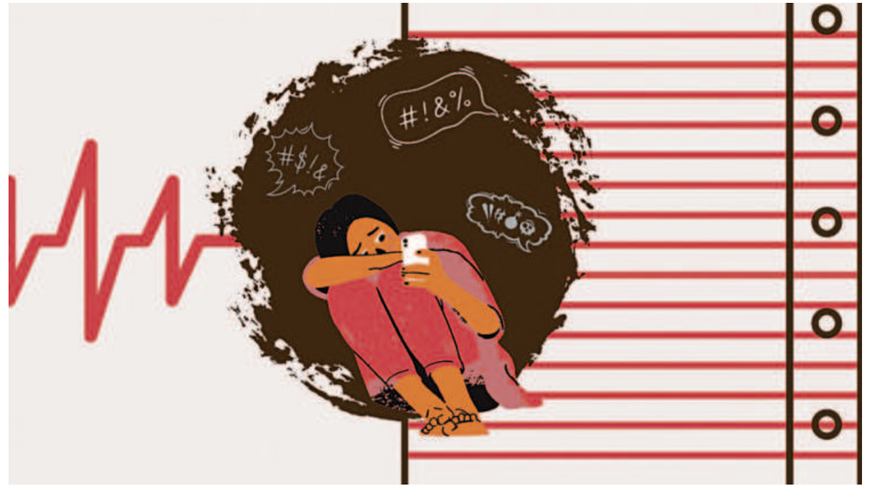
ILLUSTRATION: TEENI AND TUNI

The fact that suicide is a culmination of depression, mental illness, traumatic stress, hopelessness, social isolation and a number of other factors is completely lost upon us. But where the general public fails, our institutions must show us the way.