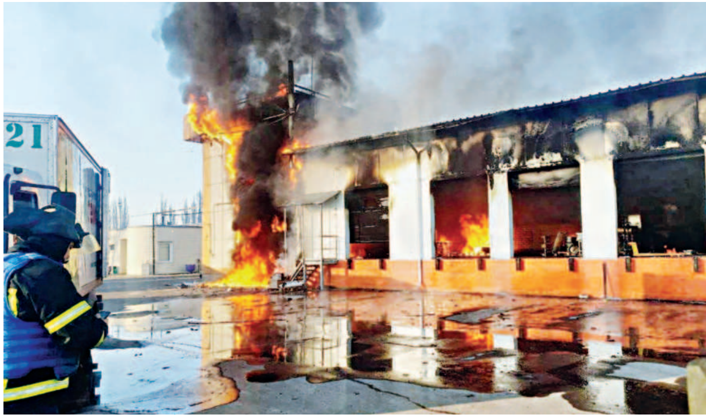
A view shows a warehouse of goods damaged by shelling, as Russia's attack on Ukraine continues, in Sievierodonetsk Ukraine, in this handout picture released yesterday. The war between Ukraine and Russia, two of the world's top crop producers, could lead to a food crisis "on the global" scale, French Farming Minister Julien Denormandie said in Brussels yesterday ahead of a EU agriculture meeting.

AFP, Washington China's ambassador to the US said Sunday his country was not sending weapons to Russia for use in Ukraine, but he did not definitively rule out the possibility Beijing might do so in the future. In a lengthy phone call Friday, US President Joe Biden warned his Chinese counterpart Xi Jinping that there would be "consequences" if Beijing provided material support to Moscow as it prosecutes its war against Kyiv. Asked Sunday on CBS whether China might send money or weapons to Russia, Ambassador Qin Gang spoke about the present, saying: "There is disinformation about China providing military assistance to Russia. We reject that."