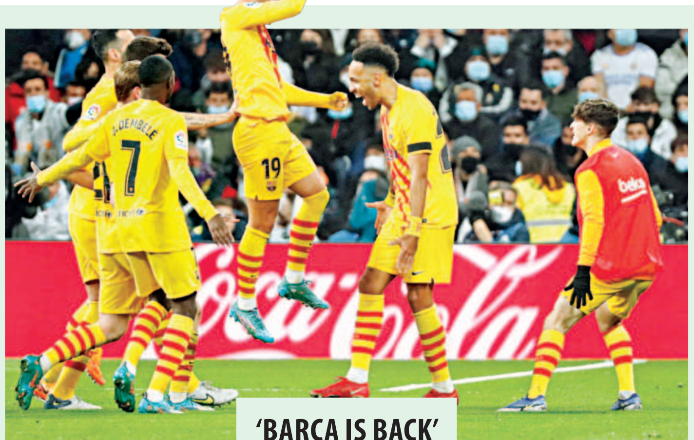
'BARCA IS BACK'

Pierre-Emerick Aubameyang celebrates his second goal with teammates during Barcelona's 4-0 thrashing of rivals Real Madrid at Santiago Bernabeu on Sunday. Xavi Hernandez's side gave a football masterclass in a match they dominated from the start and which they arguably deserved to win by even more than four goals. "I'm delighted, it's a night to enjoy. Barca is back. Today we showed that we can fight against a great Real Madrid team that are on a roll and in their stadium. It is a great achievement to encourage us for the future of our project," Xavi told the reporters.