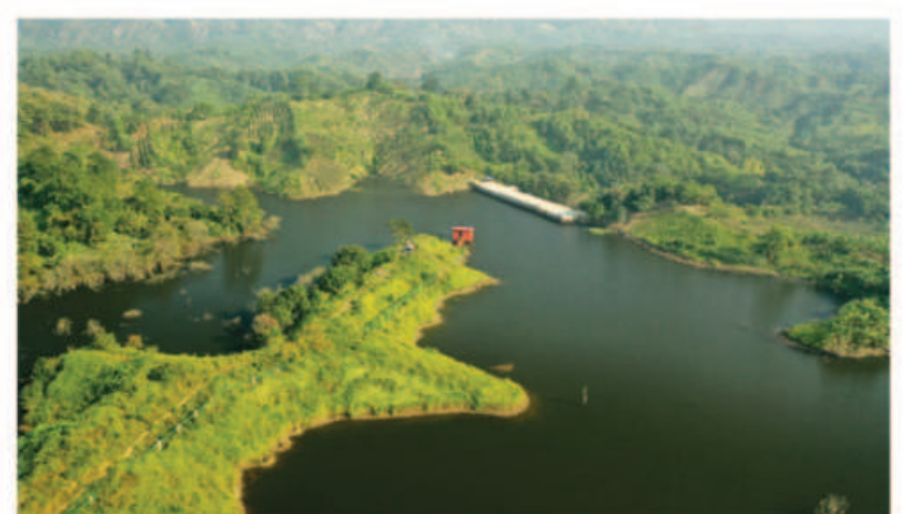
GPH lake certified by IWM to harvest rainwater