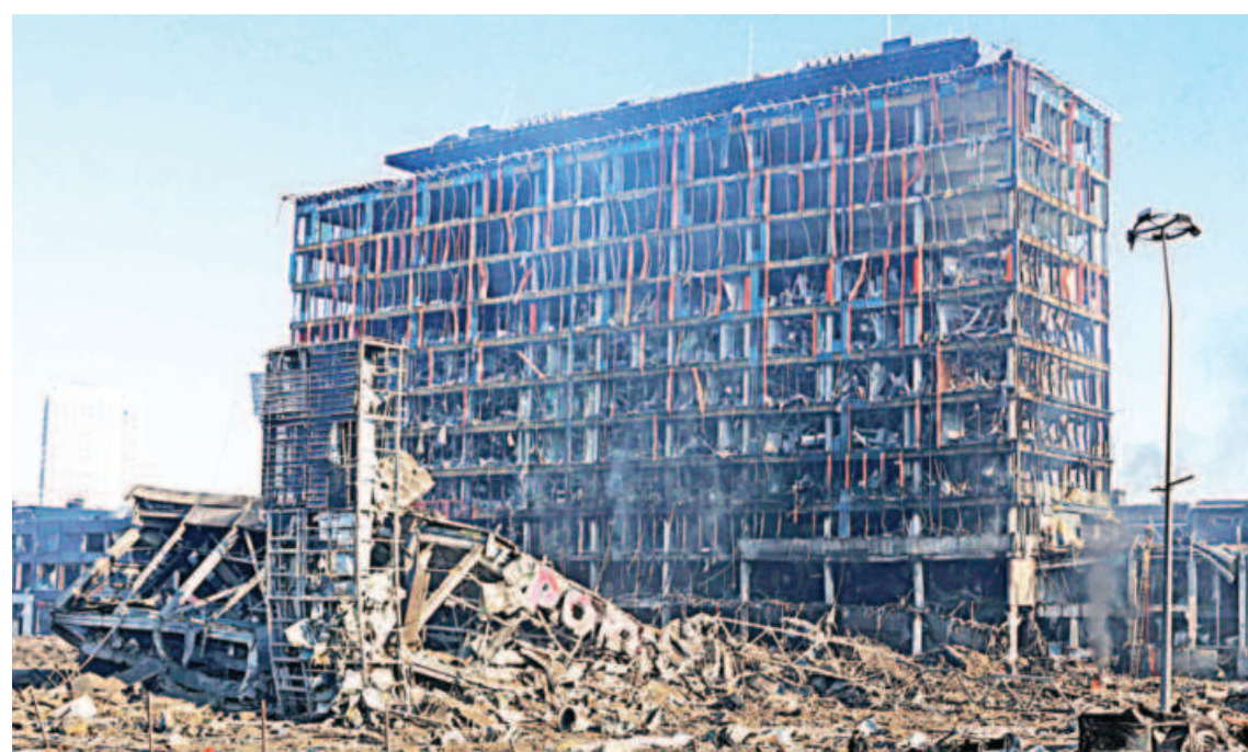
The site of a destroyed shopping centre is seen after it was hit in a military strike in the Podilskiy district of Kyiv, as Russia's invasion of Ukraine continues, in Kyiv yesterday.