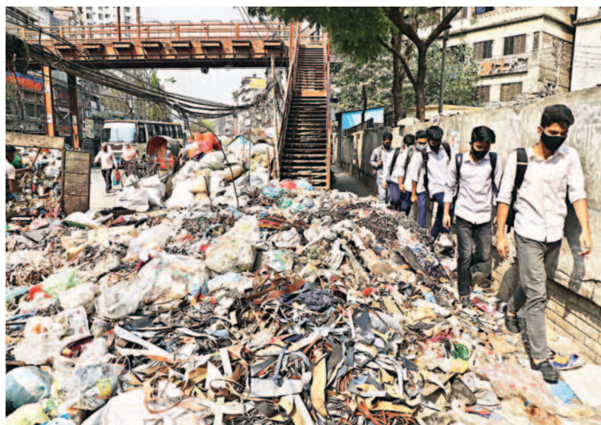
Right down the stairs of this footbridge in front of Shulitola High School on the capital's Bongshal Road, a garbage dump has been created, taking up parts of the road and pavement. What's more, signs around the place specifically ask people not to dump waste there. This photo was taken yesterday.

A total of 360 projects from different countries, under 18 categories, have been nominated for the awards.