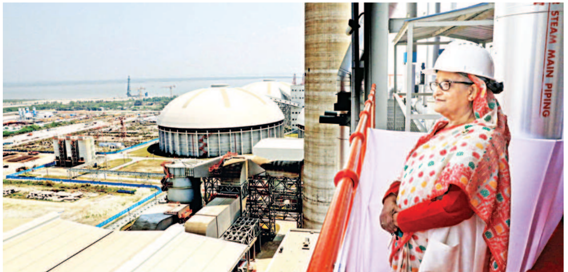
Prime Minister Sheikh Hasina inspects the 1,320MW Payra Thermal Power Plant after inaugurating it in Patuakhali yesterday. During the inauguration, she said 100 percent of the country's population has been brought under electricity coverage.