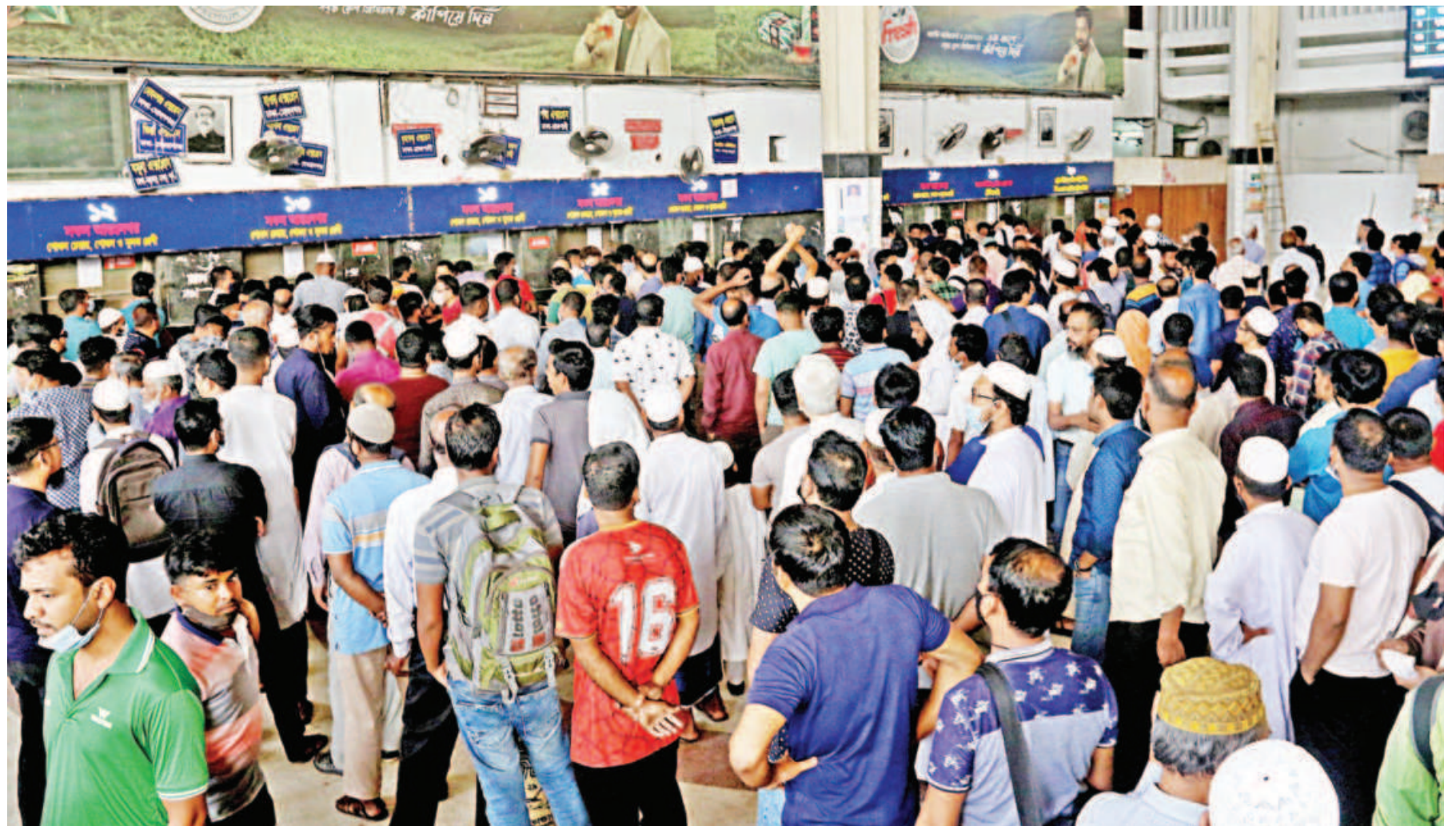
People through the capital's Kamalapur Railway Station yesterday to buy tickets. The queues before the counters grew longer as the online ticket sale remains suspended for five days until Friday to facilitate smooth handover of the ticketing service to a new vendor.