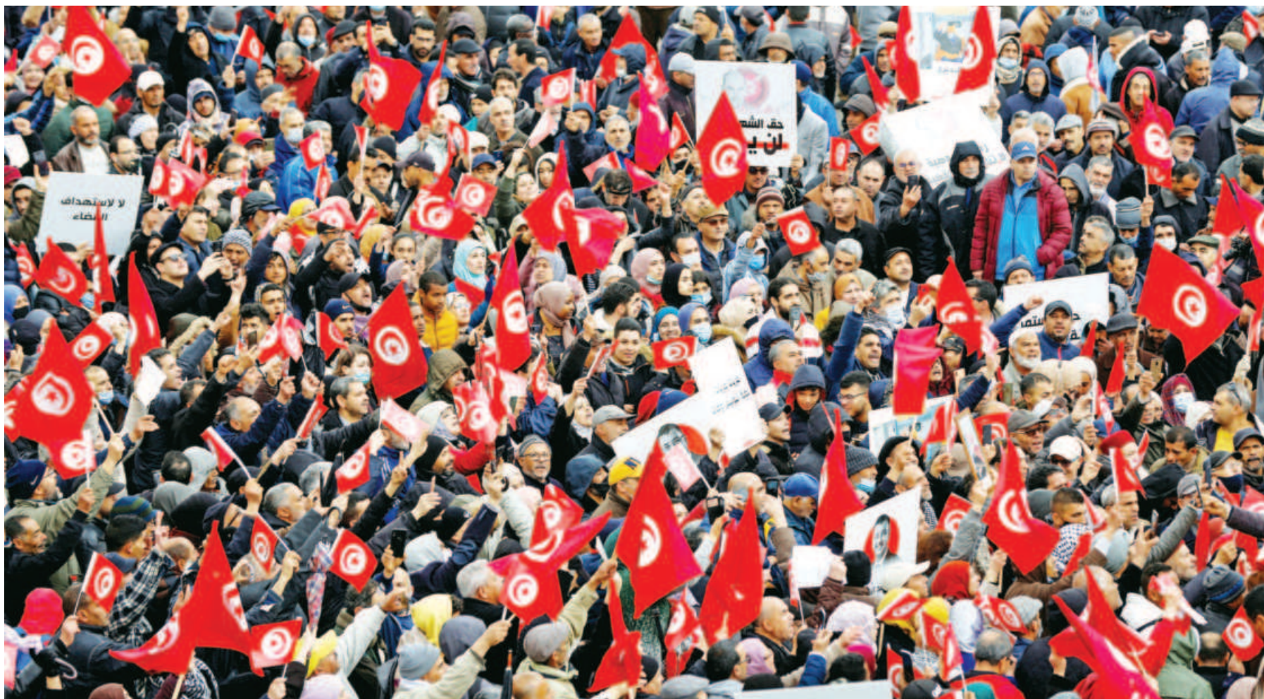
Demonstrators hold placards and Tunisian national flags during a protest against Tunisian President Kais Saied's seizure of governing powers, in Tunis, Tunisia yesterday. Saied last July sacked the government and moved to rule by decree, sparking fears for democracy in the birthplace of the 2011 Arab uprisings.