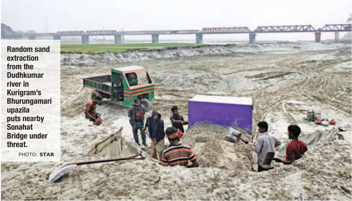
Random sand extraction from the Dudhkumar river in Kurigram's Bhurungamari upazila puts nearby Sonahat Bridge under threat.