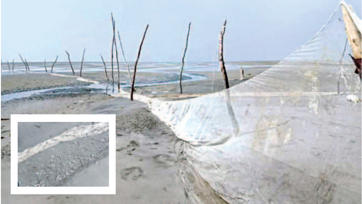
A section of fishermen fishing near Char Bijoy has been killing fish fries. The photo was taken recently.