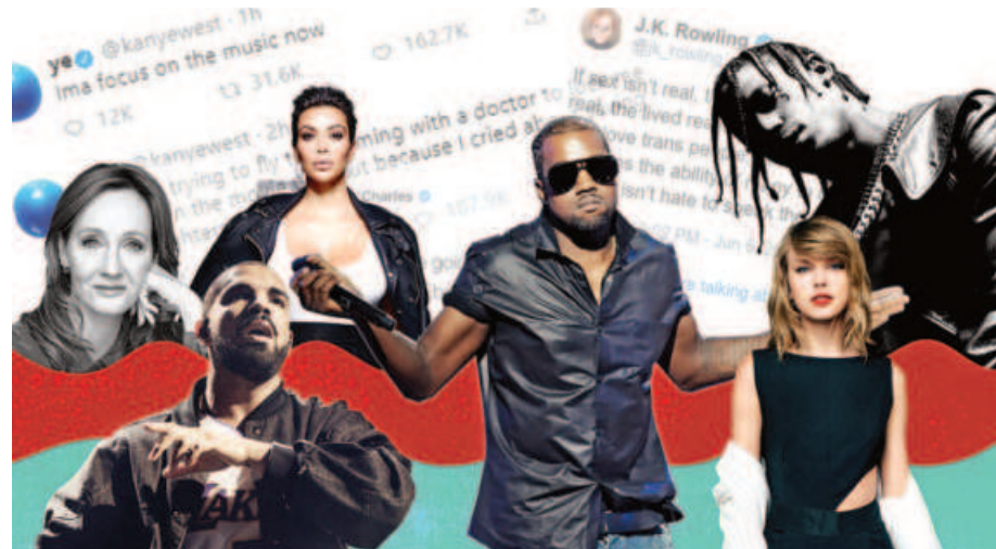
DESIGN: SYEDA AFRIN TARANNUM

However, the media we interact with regularly aren't created in vacuum, it was created with specific intentions, even if sometimes those intentions are dreadfully simple. So, critically analysing our choice movies or music are a way to engage with those intentions, to interact with the