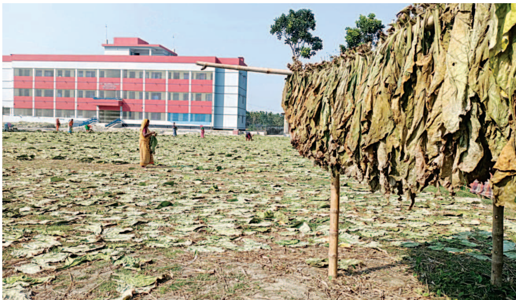
Tobacco leaves being dried in the sun on the ground of Durgapur Government Primary School in Lalmonirhat's Aditmari upazila, putting the health of the students, the teachers as well the tobacco workers, who hardly use any protections, under risk. Children can no longer play on the field, and the strong smell from the leaves has spread. The photo was taken on Thursday.