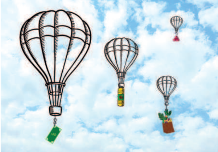
▲ COLLAGE: STAR

Bangladesh is dependent on imported oils. The oil prices for Brent crude oils have