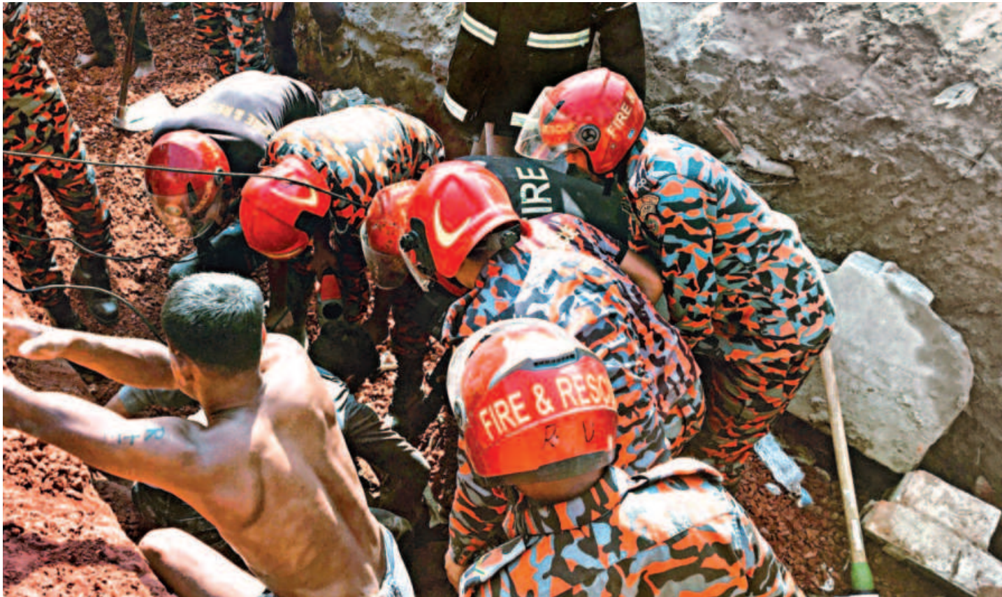
Firefighters along with locals conducting a rescue operation that lasted three hours after a wall collapsed in Rajshahi city's Chhotobon village yesterday killing one and injuring four.