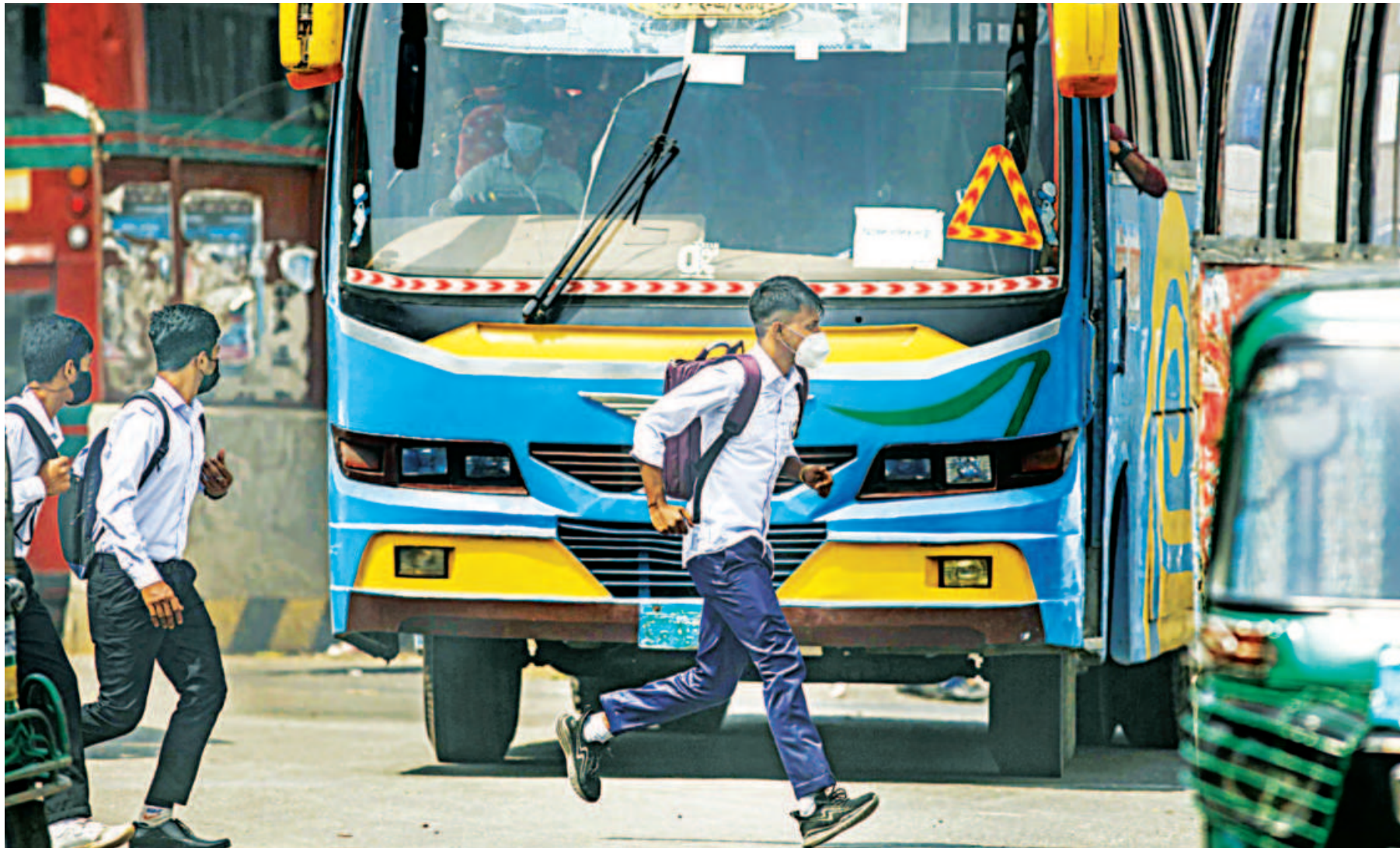
Even though a footbridge is nearby, students run across a street in front of a bus at speed in the capital's Farmgate area. The photo was taken yesterday.