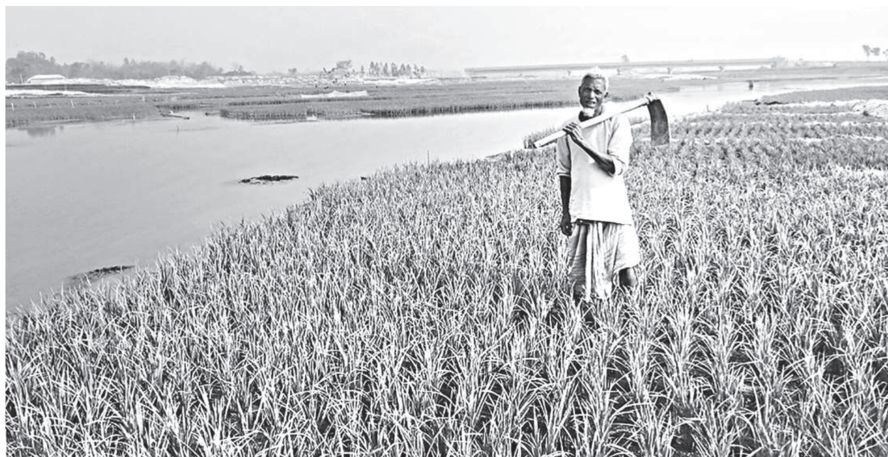
People cultivating Boro paddy on Charalkata riverbed in Mohabbat Bazitpara village of Nilphamari Sadar upazila.