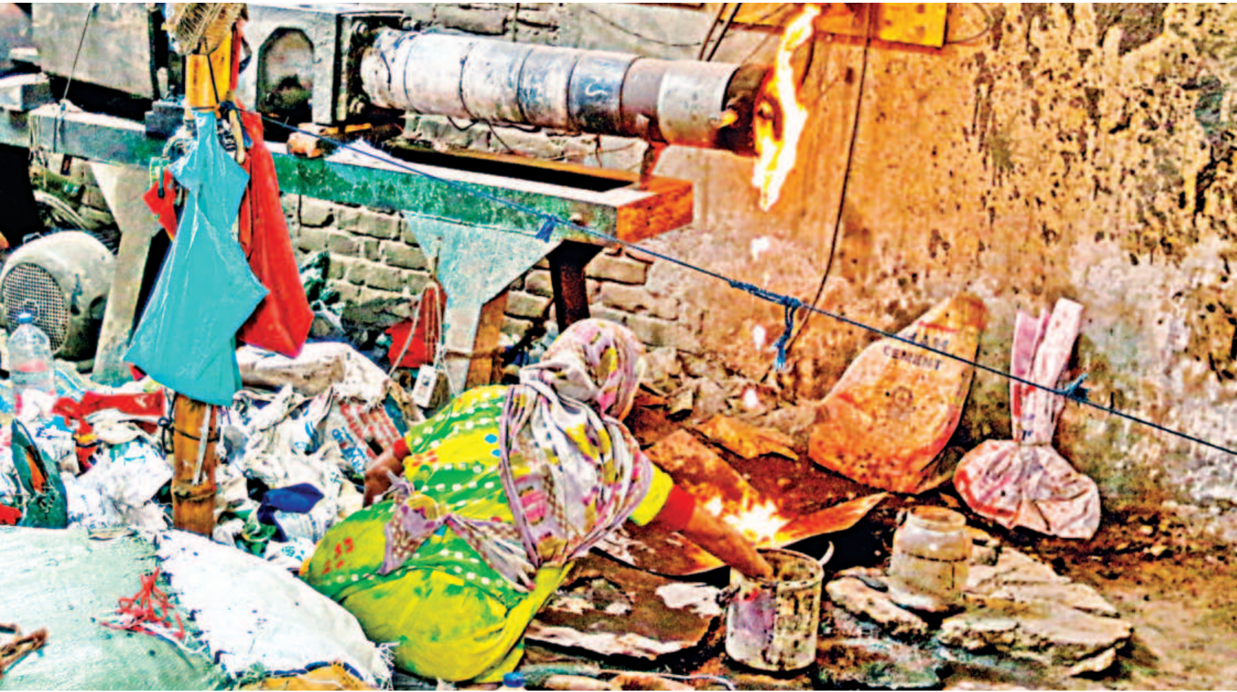
Discarded plastic collected from all over the city is brought to “galai” factories in Lalbagh and Kamrangirchar. Here, the plastic is burned and turned into lumps, which are then sold by the kilo. Most of the staffers at these factories are older women, who work for meagre sums of Tk 300-350 a day, without any safety gears. If they ever come into contact with the fire, they simply dip the affected area into a bucket of water. This photo was taken yesterday.