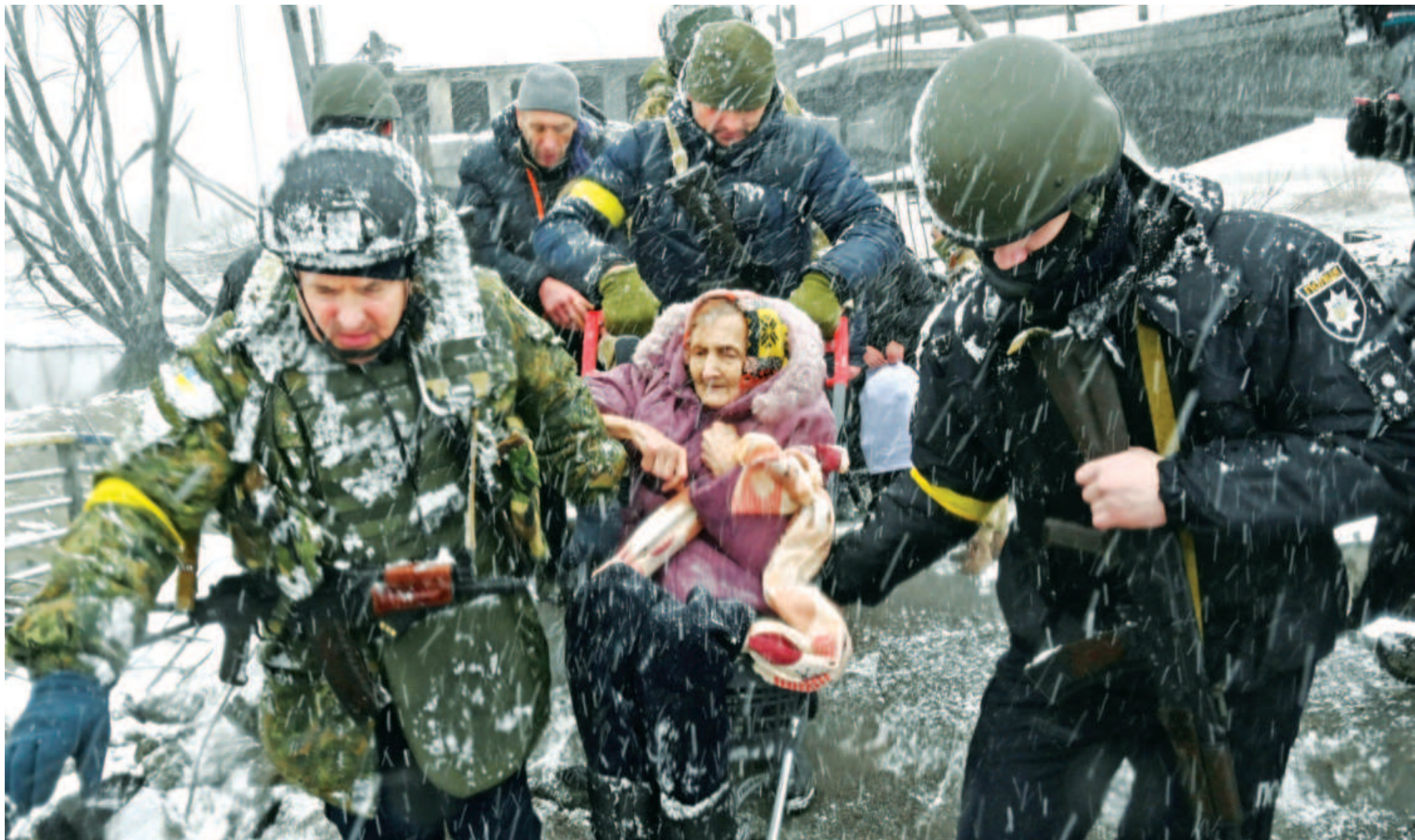
Ukrainian soldiers help an elderly woman to cross a destroyed bridge as she evacuates the city of Irpin, northwest of Kyiv, yesterday.

New airlines not getting permission to operate