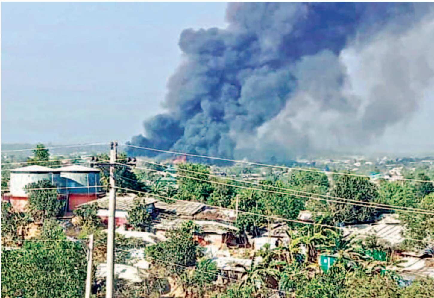
Smoke billowing out of the Madhurchhara Rohingya camp-5 in Cox's Bazar's Ukhiya upazila after a fire broke out there yesterday afternoon. The blaze killed a child and destroyed about 300 shanties. The cause of the fire could not be known immediately.