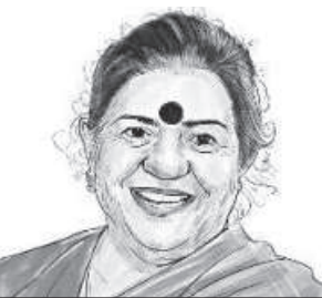
Dr Vandana Shiva is an Indian scholar, author, environmental activist, ecofeminist and food sovereignty advocate based in New Delhi.