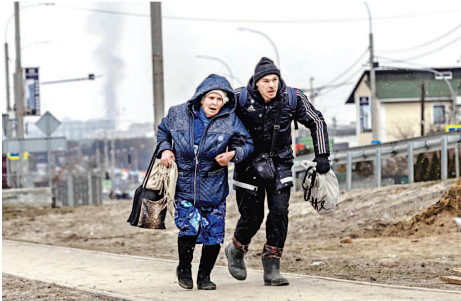
A man helps an elderly woman to run for cover after heavy shelling on the only escape route used by locals, while Russian troops advance towards the capital, in Irpin, near Kyiv, Ukraine, yesterday.

P9 Revive the past glory of Bangladesh railway