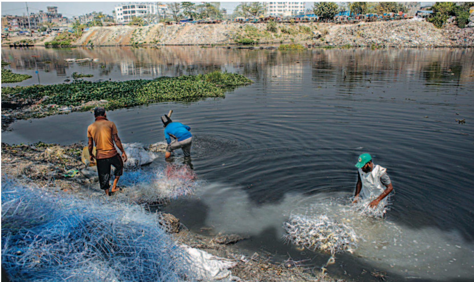
Workers of a plastic factory wash raw materials in the Buriganga as the chemical residue turns the water whitish. The river doesn't get a break from pollution as industrial and other waste are mindlessly dumped in its water.