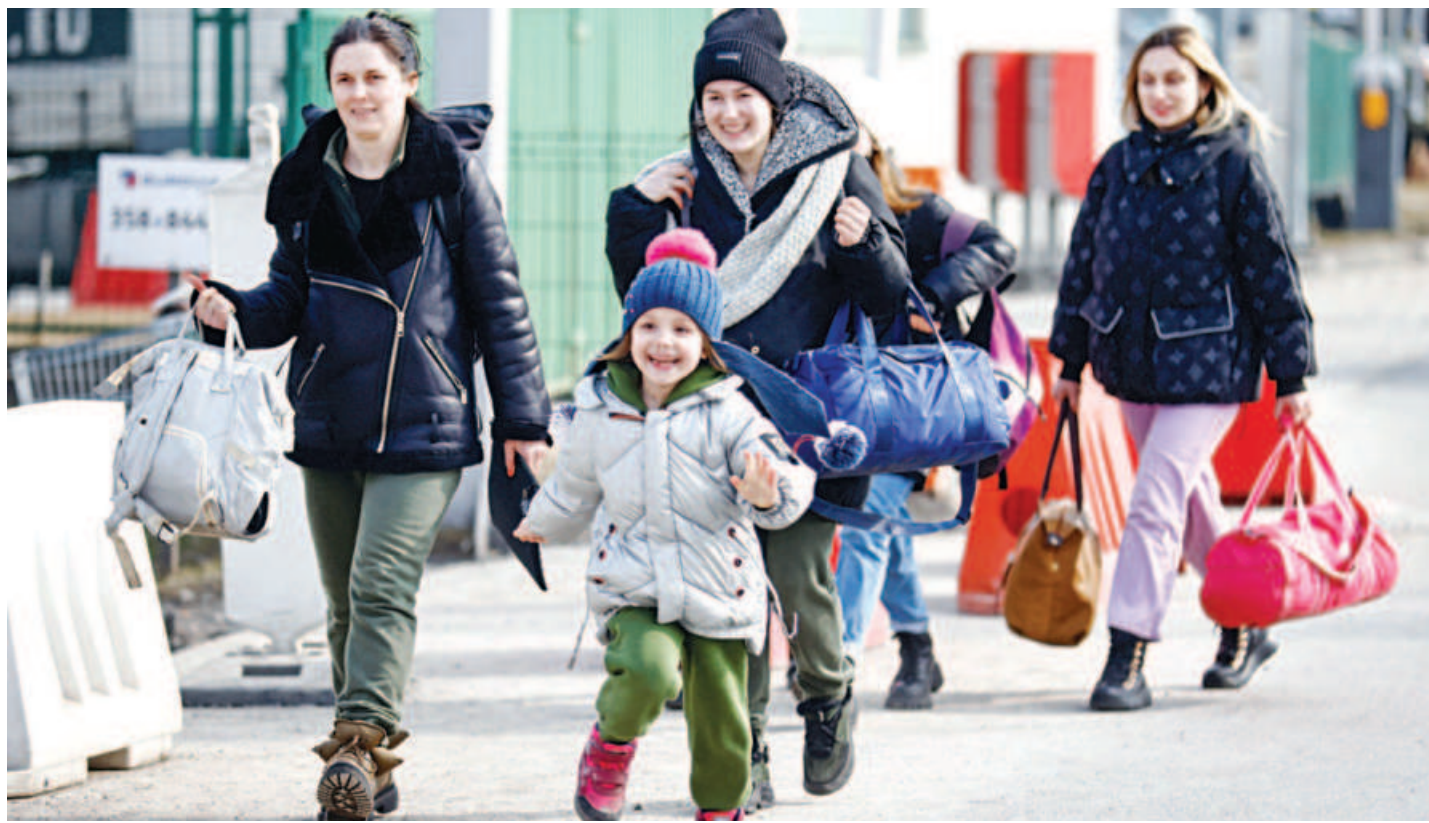
A child runs towards his father after fleeing the Russian invasion of Ukraine, at the border checkpoint in Medyka, Poland, yesterday. More than 1.2 million people have fled Ukraine into neighbouring countries since Russia launched its full-scale invasion on February 24. The EU is setting up humanitarian hubs to help Ukraine in eastern member countries.