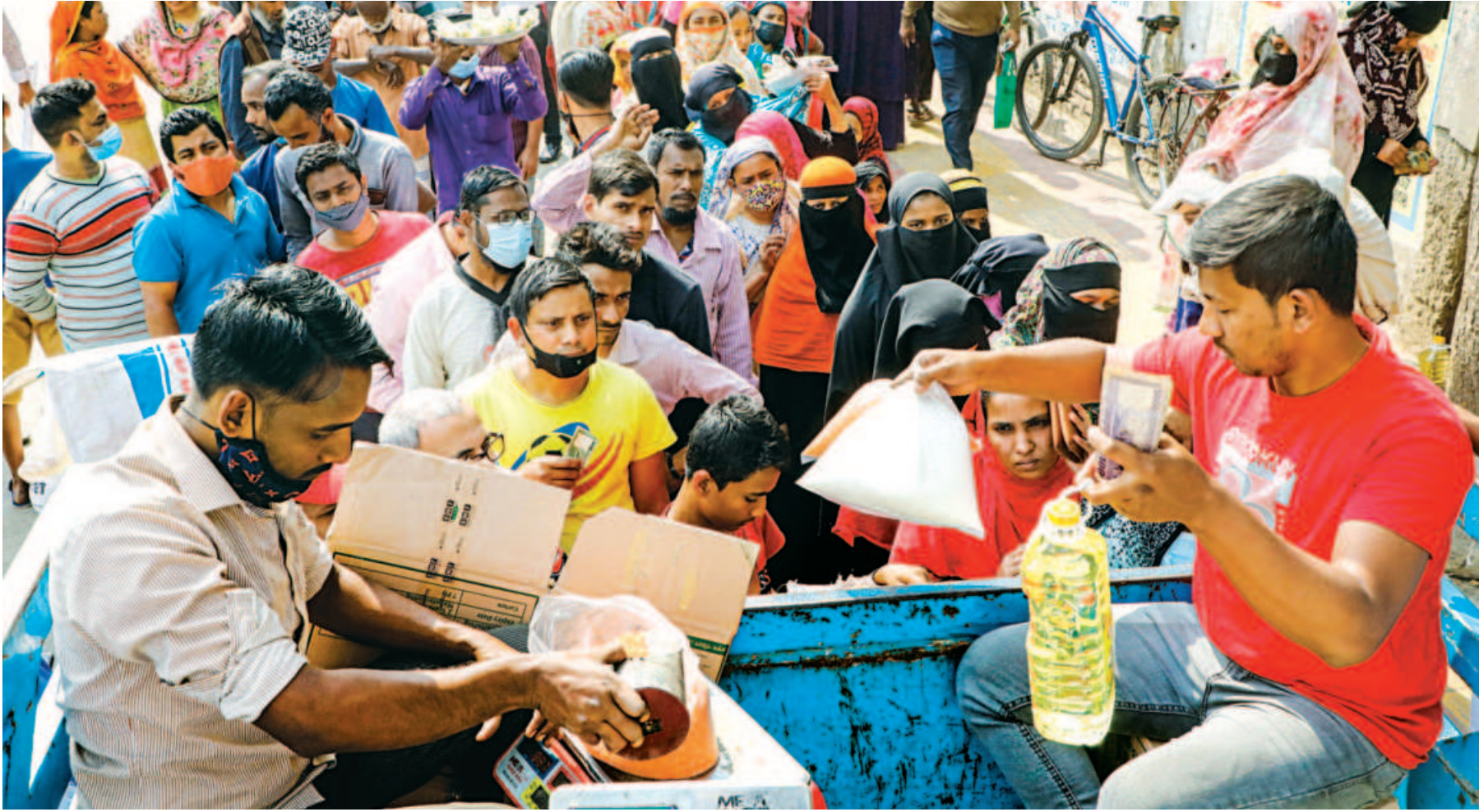
The rise in food prices has compelled many people to turn to the trucks of state-run Trading Corporation of Bangladesh to buy essential items at rates that are lower than the market prices. Food inflation facing the poor is more than twice the official figure, said a think-tank yesterday. The photo was taken from the capital's Mohammadpur area recently.