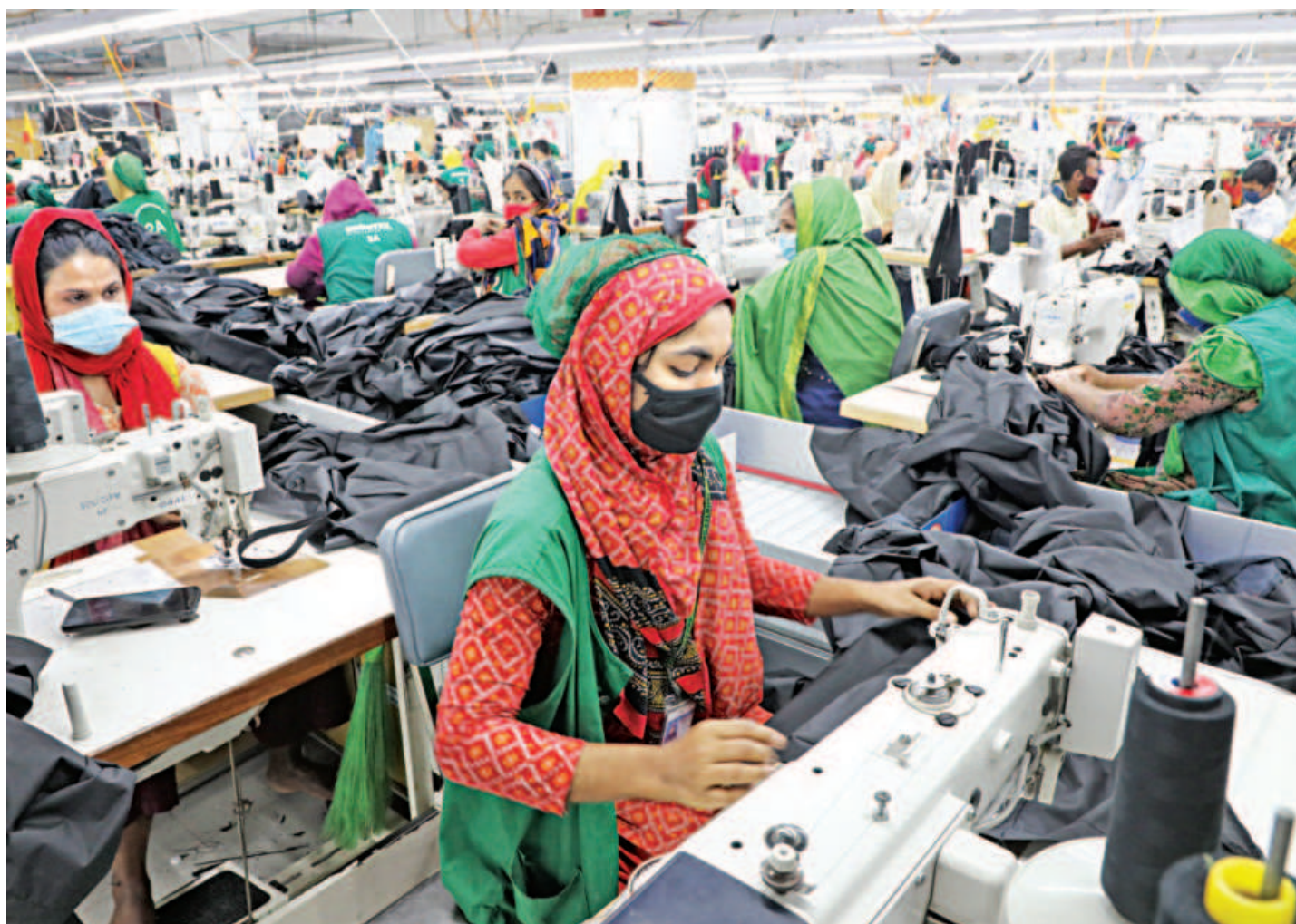
Workers at a garment factory are seen busy as the industry has witnessed a rise in work orders in recent months. Garment exports grew 30.73 per cent to $27.49 billion in the July-February period of the ongoing fiscal year. The picture was taken recently.