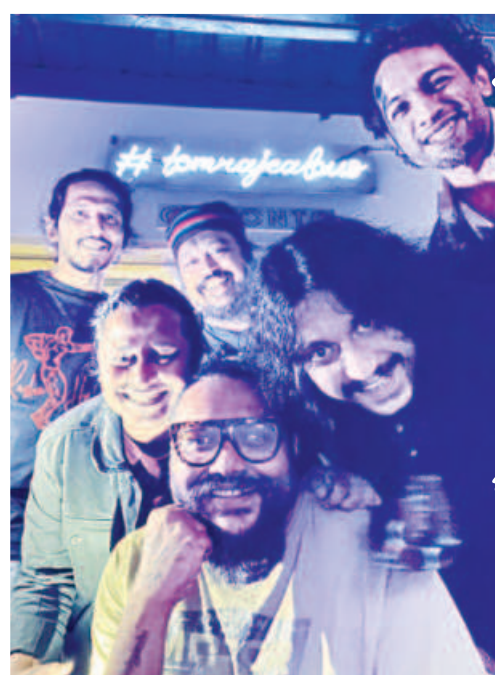
Hours of studio work went in behind "Nasek Nasek".