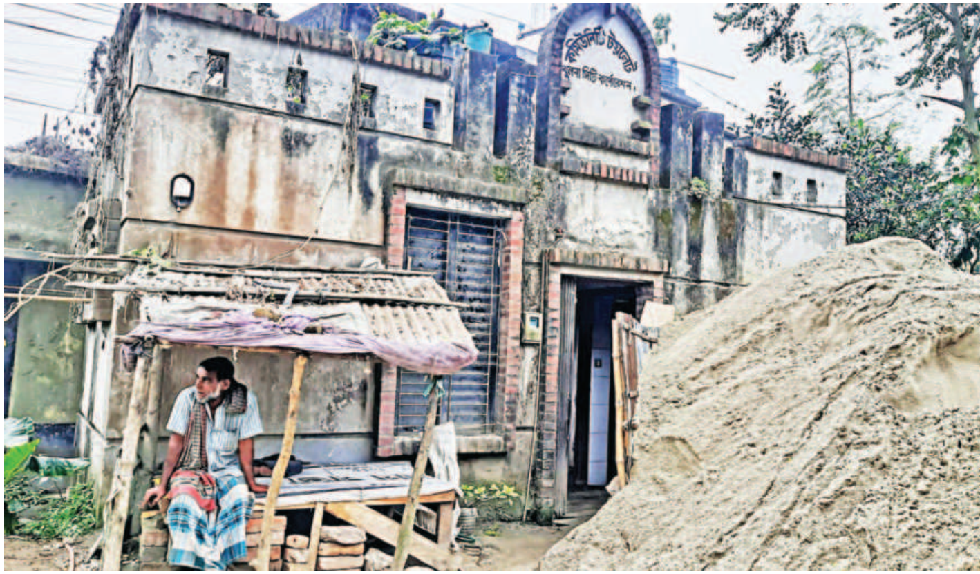
The front side of this particular toilet has been handed over to sand traders, as the lessee seeks to make some money out of the premises. He said he's compelled to do this as city dwellers don't visit the toilets, mostly owing to their shambolic conditions.