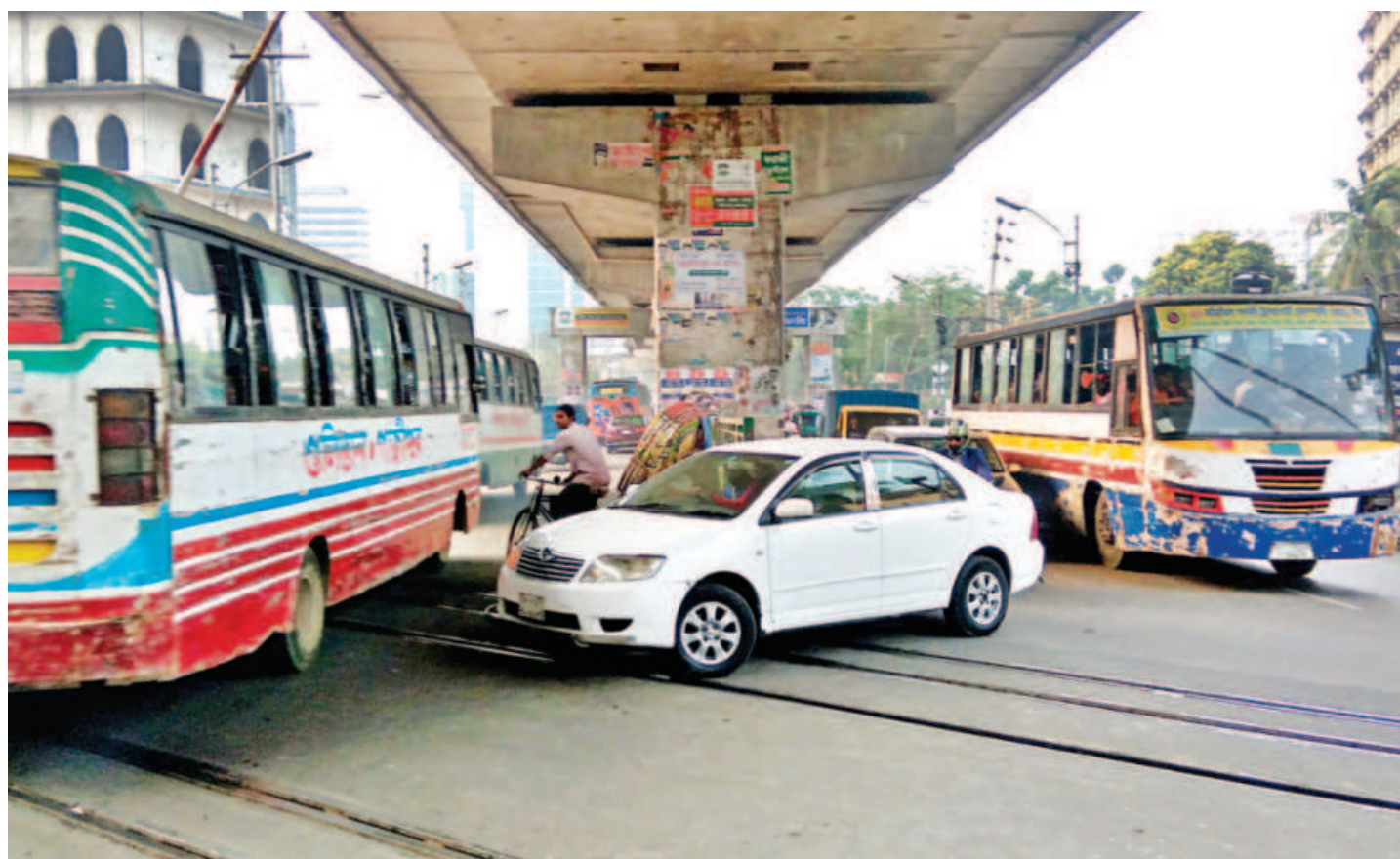
A car making an illegal U-turn on the Moghbazar level crossing in the capital yesterday. There is a designated place for U-turns only a few yards ahead. Such manoeuvres are dangerous as this forces vehicles to stop on the level crossing.