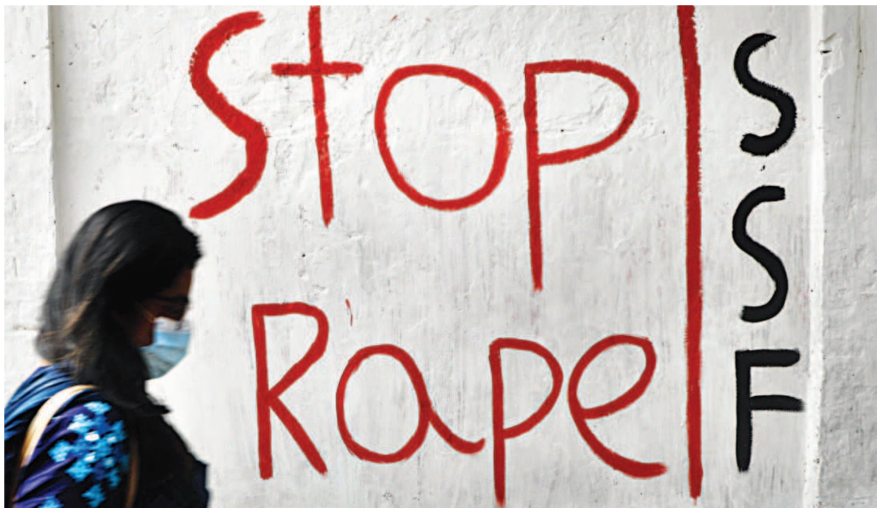
A woman walking past a "stop rape" graffiti painted by a left-leaning student organisation inside Dhaka University campus. Incidents of rape are being reported almost every day. Recently, the gang rape of a student of Bangabandhu Sheikh Mujibur Rahman University of Science and Technology, Gopalganj, sparked protests. The photo was taken yesterday.