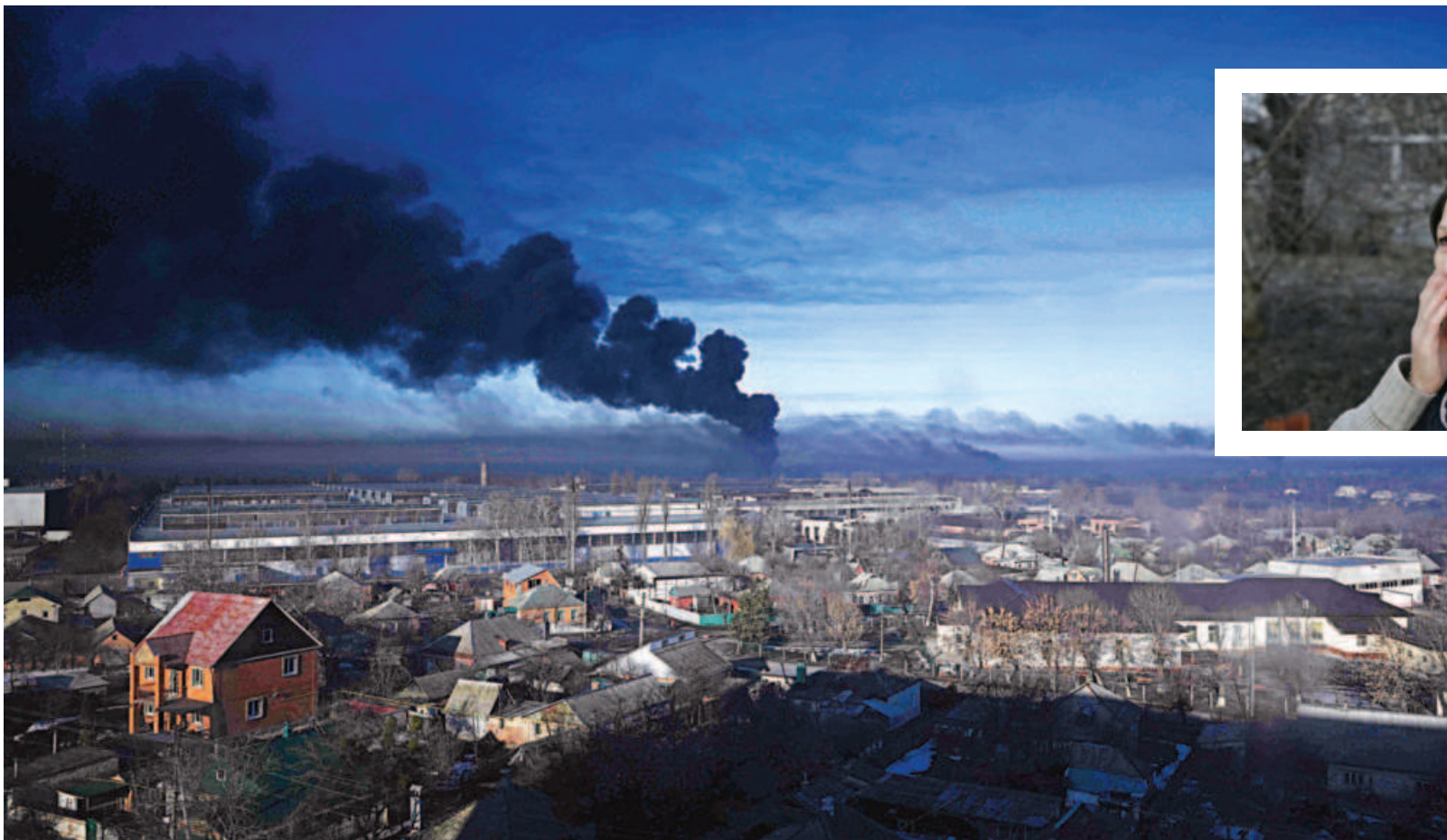
Black smoke rises from a military airport in Chuguyev near Kharkiv, Ukraine, yesterday after Russian attacks. Inset, a woman reacts after the Chuguyev military airport attack.

Dozens killed; Nato activating 'defence plans' for allies, but says won't send troops to Ukraine; thousands flee as missiles rain down across the country