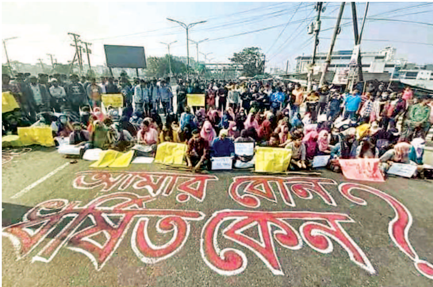
Students of Bangabandhu Sheikh Mujibur Rahman Science and Technology University block the Dhaka-Khulna highway in Gopalganj Sadar's Ghonapara area yesterday, protesting the gang-rape of a fellow student on Wednesday night. They painted "why has my sister been raped?" on the road during the demonstration.