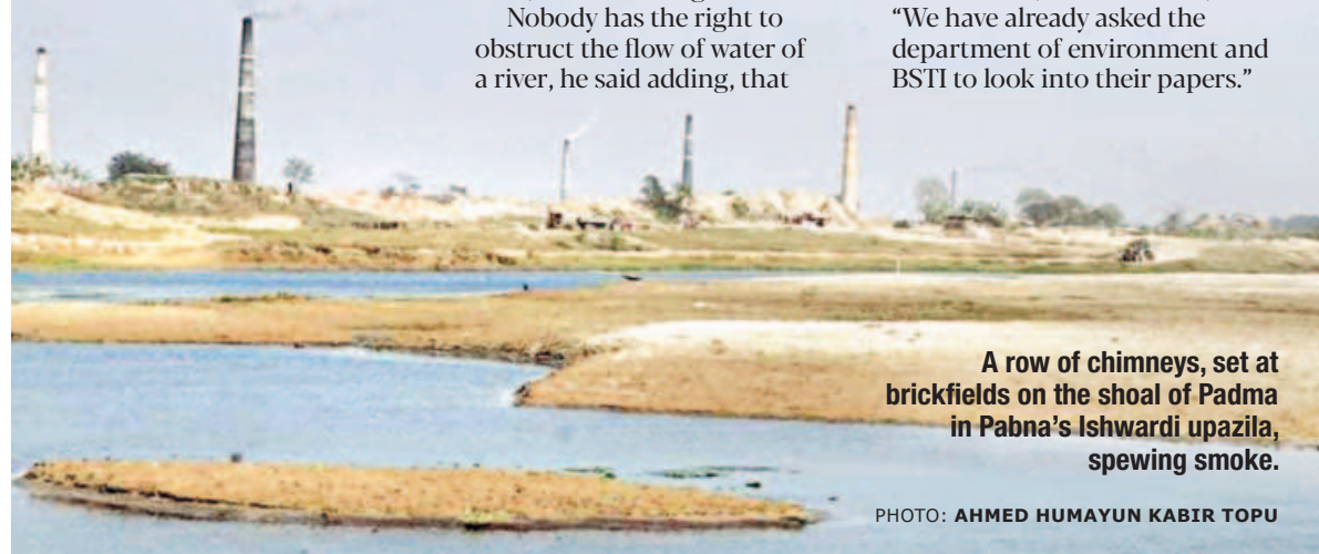
A row of chimneys, set at brickfields on the shoal of Padma in Pabna's Ishwardi upazila, spewing smoke.

Asked about the mushrooming illegal brickfields in the union, the ADM said, "We have already asked the department of environment and BSTI to look into their papers."