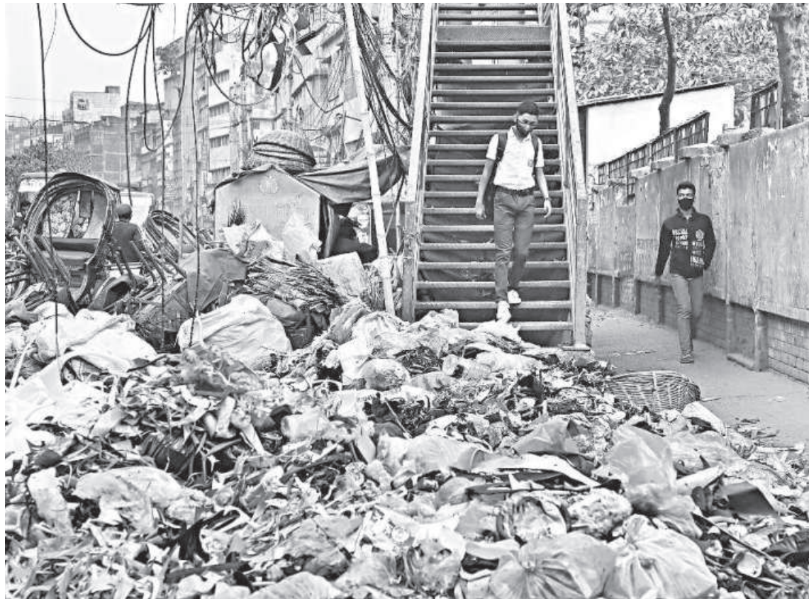
Indiscriminately dumped garbage in front of this foot overbridge at Old Dhaka's Shuritolia is making life difficult for students of a nearby school and other pedestrians who use the bridge to cross the busy road. This photo was taken yesterday.