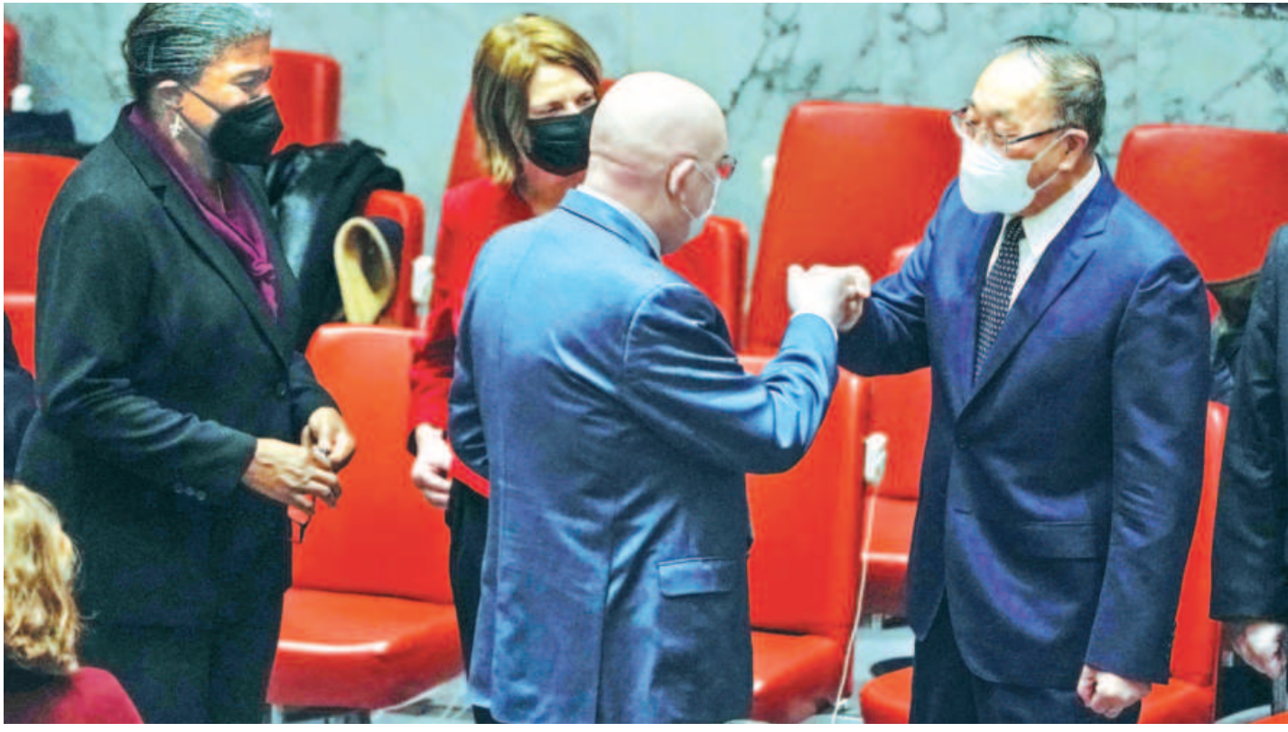
Permanent Representative of the Russian Federation to the United Nations (UN) Vasily Nebenzya (C) fist bumps Ambassador Zhang Jun, Permanent Representative of China to the UN, as US ambassador to the UN Linda Thomas-Greenfield (L) looks on during an emergency meeting of the UN Security Council on the Ukraine crisis, in New York, US on Monday evening.

Yesterday, the Ministry for the Promotion of Virtue and Prevention of Vice issued a statement saying women should not go to work unless they were properly covered, and they could be fired if they did not follow guidelines.