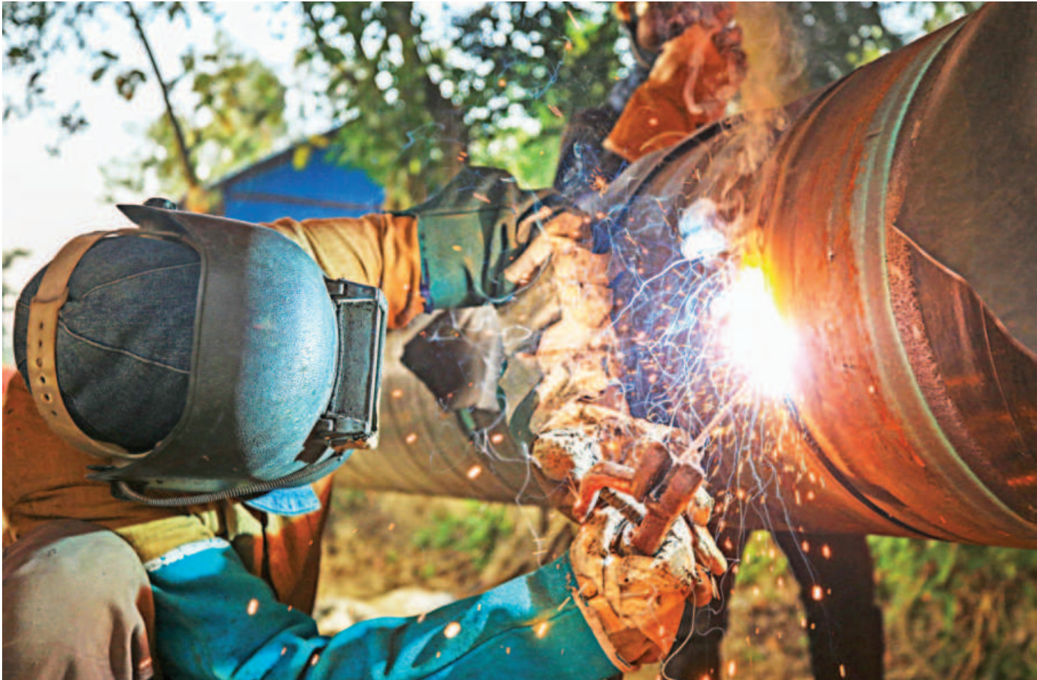
A welder works on a 249.57-kilometre fuel pipeline being set up from Chattogram to Dhaka at a cost of Tk 758 crore. Currently private entities transport 22 lakh tonnes of fuel annually on coastal tankers from the port city to Godnail and Fatullah in Narayanganj and Daulatpur upazila of Khulna. The pipeline will save Bangladesh Petroleum Corporation Tk 5,000 crore a year alongside ensuring energy security. The photo was taken at Sitakunda upazila last month.