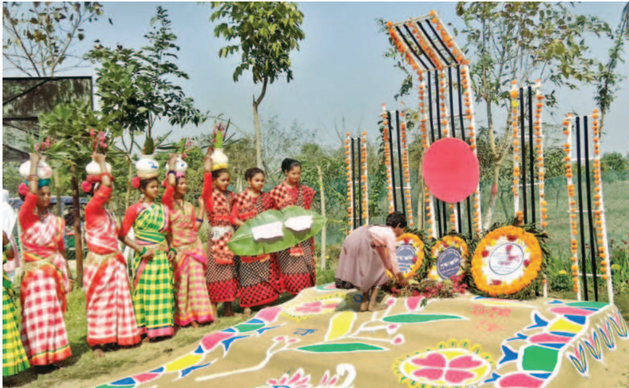
A student lays a wreath at the foot of a Shaheed Minar in Babudying village of Rajshahi's Godagari upazila on International Mother Language Day yesterday. Students of Babudying Adivasi School built the memorial with earth and bamboo and adorned it with flowers to show respect to the Language Movement martyrs.