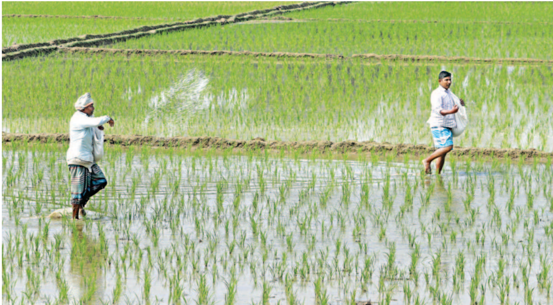
Farmers are using fertilisers in a boro field in order to make the newly-planted seedlings stronger and more fruitful and improve the fertility of the soil. The photo was taken from Nashipur village in Dinajpur sadar upazila on Sunday.