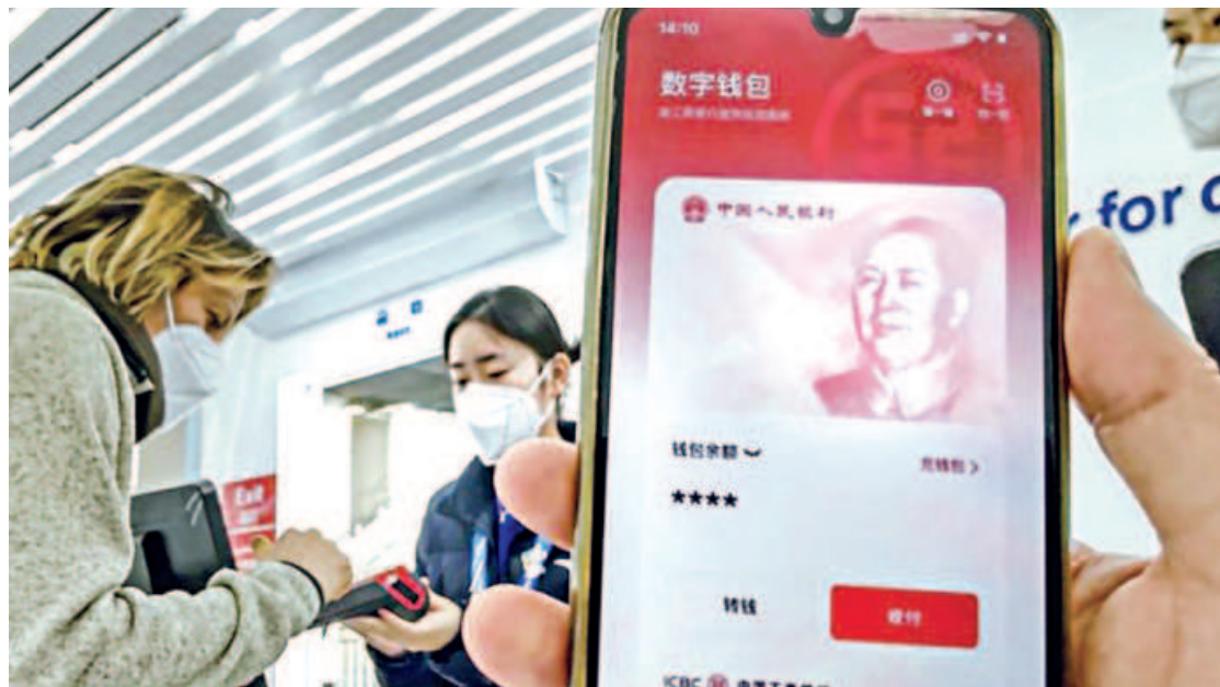
The e-CNY app is seen on a smartphone at the Main Media Center in Beijing on Saturday.

Analysts said the market remained tight and any addition of oil would help, but prices would remain volatile in the near term because Iranian crude is unlikely to return until later this year.