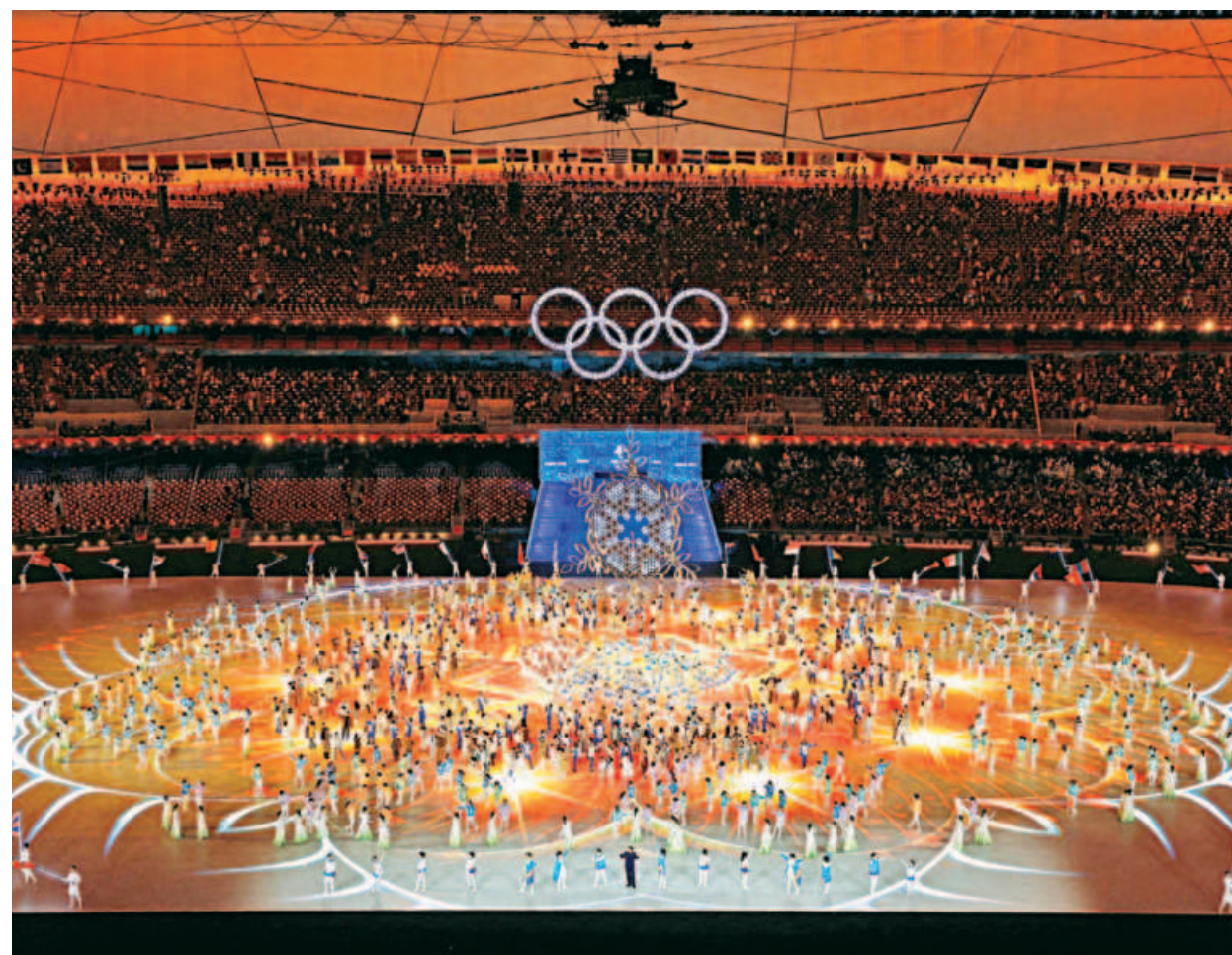
Beijing doused its Olympic flame on Sunday night, closing a Games that will be remembered as much for the extremes of its anti-Covid-19 measures as the performances on display. Chinese President Xi Jinping was on hand for the snowflake-themed ceremony at the Bird's Nest stadium, where IOC President Thomas Bach described the Beijing Games as "truly exceptional" before declaring them closed.

"To have this thought, in the final minutes, their goal could have killed you. Instead my players wanted to win. I think in every moment of the game my team wanted to attack them. Every time we had the ball I was thinking we could hurt them." The surprise win lifted Tottenham back into seventh spot.