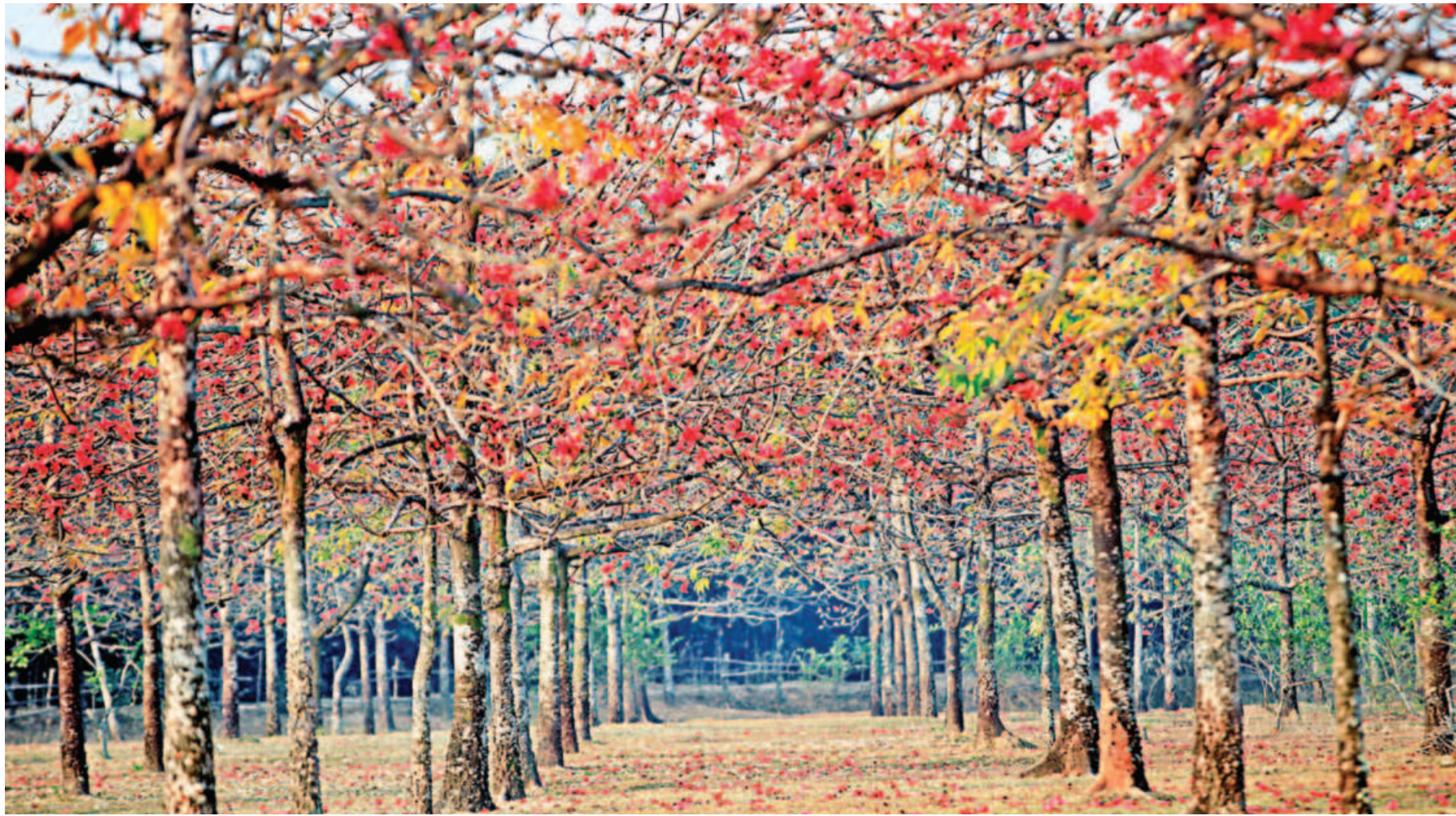
It's like a blanket of red, yellow and brown has been pulled over this garden at the banks of Sunamganj's Jadukata river. Across this 100 bighas of land, Shimul flowers have blossomed in more than 3,000 trees. It's a delightful scene, and visitors are finding it hard to not spend time here, alone or with their loved ones. This photo was taken from Tahirpur upazila's Badaghat area recently.