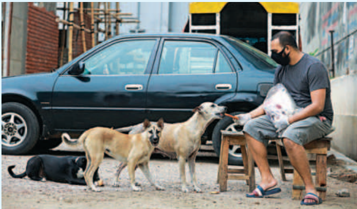
A man feeding stray dogs in front of Dhaka College. Some phases of the pandemic saw food sources for the animals become scarcer since people retreated from the streets and restaurants were shuttered; this scene was captured on 18 April, 2020.