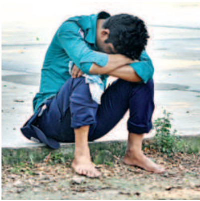
A policeman with his face buried in his arms sits at the tennis court of Jatiya Press Club after several hours of being on duty wearing PPE on Topkhana Road. In the scorching heat, one of his teammates fainted not long before. The photo was taken on 10 May, 2020.