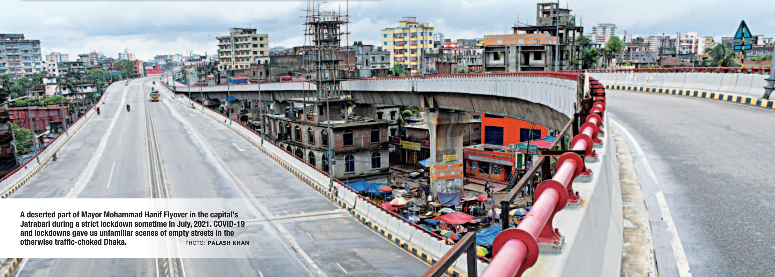
A deserted part of Mayor Mohammad Hanif Flyover in the capital's Jatra Bari during a strict lockdown sometime in July, 2021. COVID-19 and lockdowns gave us unfamiliar scenes of empty streets in the otherwise traffic-choked Dhaka.