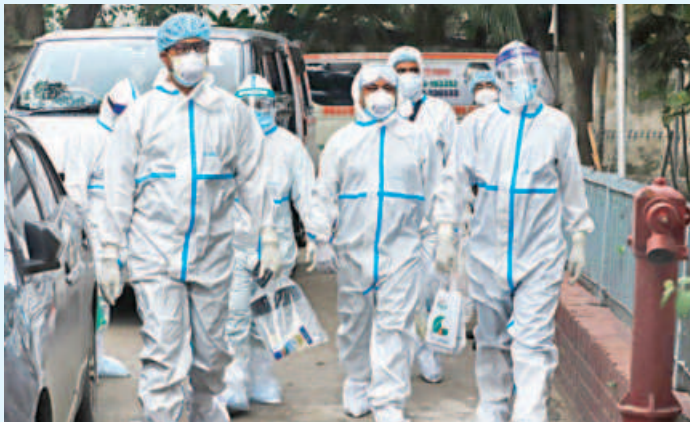
Doctors clad in PPEs enter the Covid-19 unit at Dhaka Medical College Hospital. The photo was snapped in mid-2020. Despite fears of infection, these doctors had been treating patients for around two months by then, staying at a city hospital far from home.