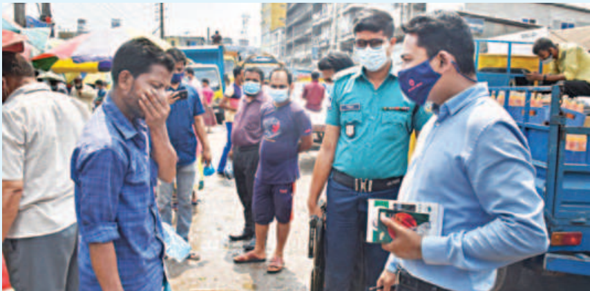
THAT'S NOT A MASK, SIR... A fishmonger covers his face with his hands as an executive magistrate of Barishal District Administration running a mobile court conducted drives across the city to enforce mask-wearing to curb the rising number of COVID-19 cases. This photo was taken from the city's Port Road area, on 31 March, 2021.