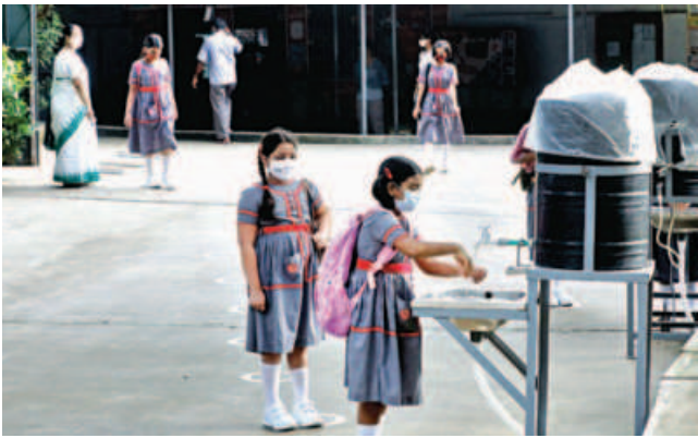
LITTLE ONES SHOW THE WAY... A child washes her hands while another one waits for her turn inside the circle marked on the ground. This photo taken at Holy Cross Girls High School shows how children can follow the rules and health safety guidelines impeccably whereas some adults fail to do so. This scene from September of 2021 also portrays the reopening of schools after a long period of campus shutdown. Schools were however shut down again after a few months due to surging cases.