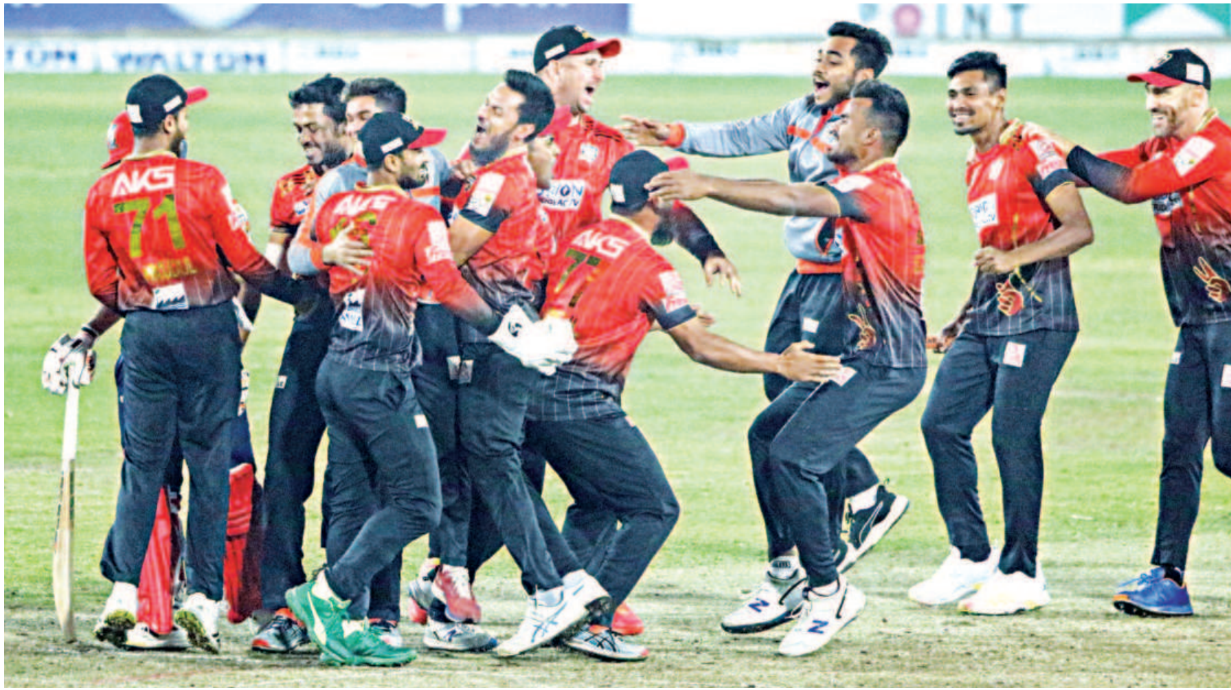
Comilla Victorians players burst with joy following their thrilling one-run victory against Fortune Barishal in the final of the Bangladesh Premier League (BPL) at the Sher-e-Bangla National Stadium in Mirpur yesterday.