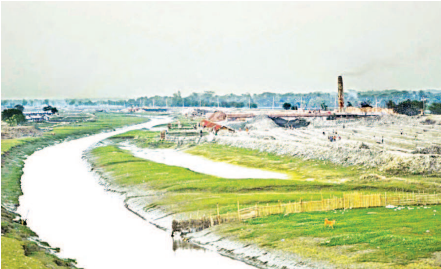
Land grabbers, including brick kiln owners, have encroached upon a long stretch of the Hori river in Khulna's Dumuria upazila, reducing the once 300-metre wide river into a canal. River-grabbing is one of the causes behind the perennial waterlogging in Bhabadaha region of Jashore. The photo was taken in Sholgotia of Dumuria yesterday.