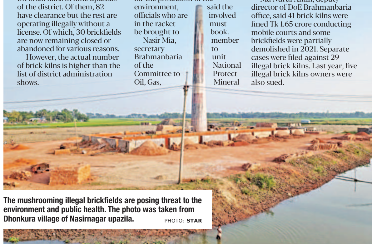
The mushrooming illegal brickfields are posing threat to the environment and public health. The photo was taken from Dhonkura village of Nasirnagar upazila.