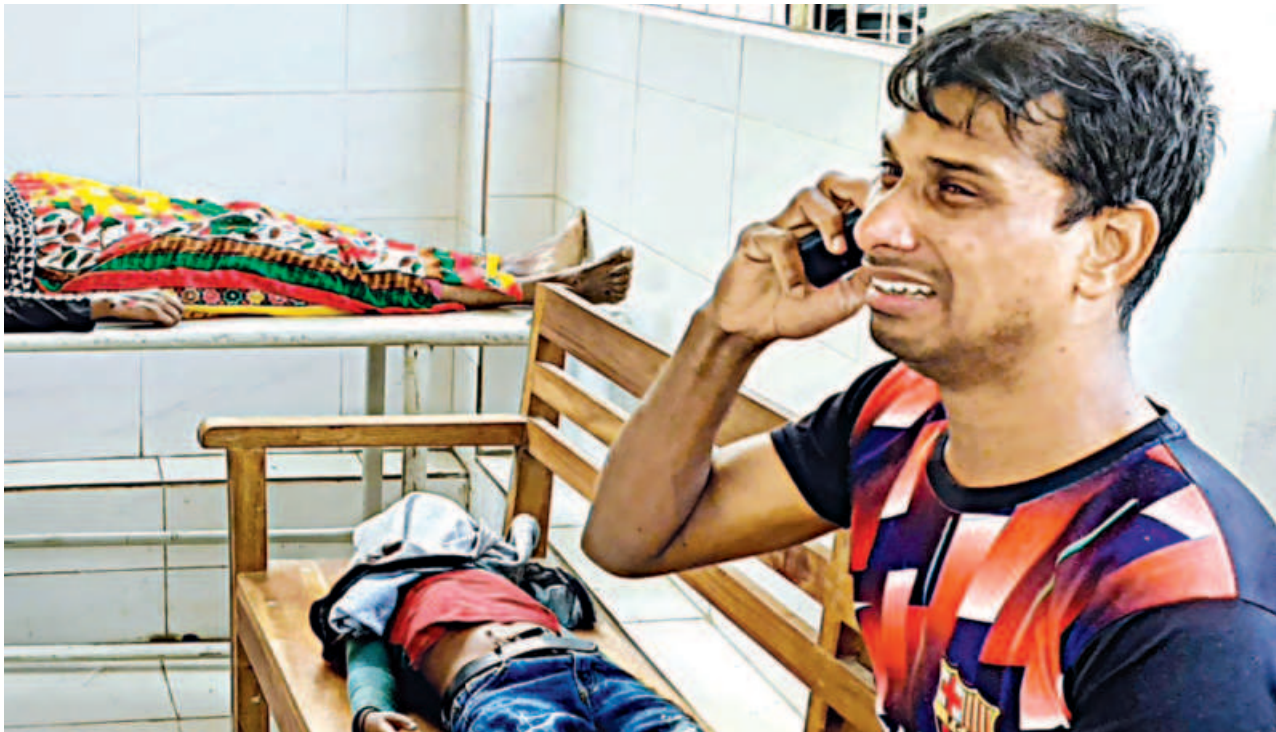
A tearful man informs relatives over the phone about the death of his son, lying on the gurney next to him, and his mother-in-law on the other gurney, at the Sreepur Upazila Health Complex. The two were killed in a three-vehicle pile-up on the road. The photo was taken yesterday.