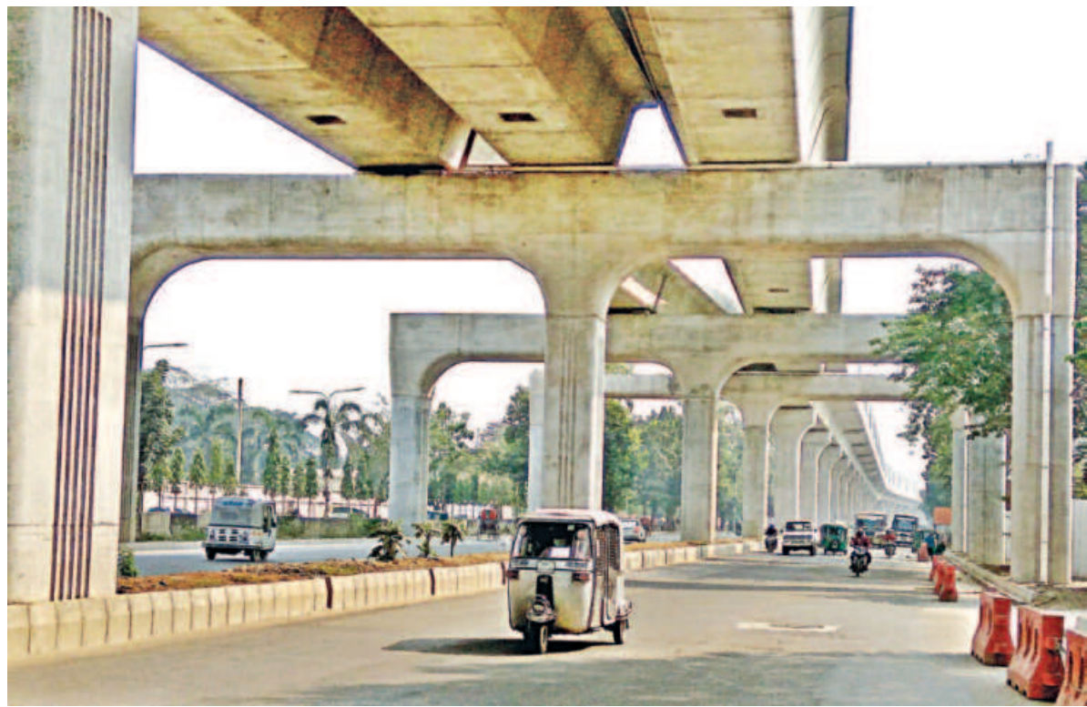
After two years of sufferings, people can now commute with some comfort as parts of Rokeya Sarani, which had been severely affected by the metro rail construction work, have been repaved. The photo was taken yesterday.