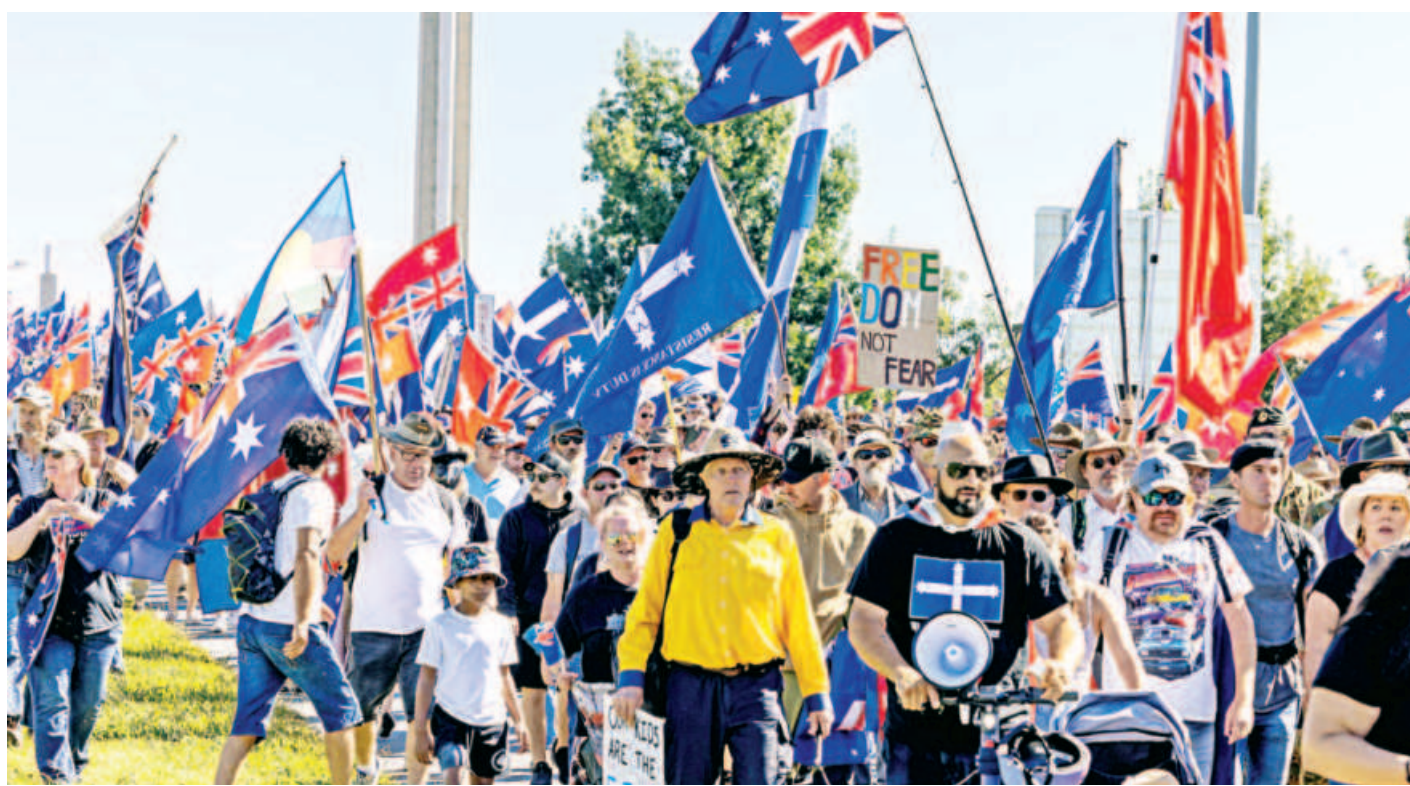
Thousands of protesters march towards the parliament building in Canberra, Australia, yesterday, to decry Covid-19 vaccine mandates, the latest in a string of rallies against pandemic restrictions around the world. A French "freedom convoy" of cars and vans began arriving in Paris yesterday for a protest over coronavirus restrictions, but the police moved quickly to prevent a Canadian-style blockade of the capital by issuing hundreds of fines.

Electricity sector workers are not on strike, but they too have threatened trade union action if the government goes ahead with plans to sell a thermal power plant to a US company.