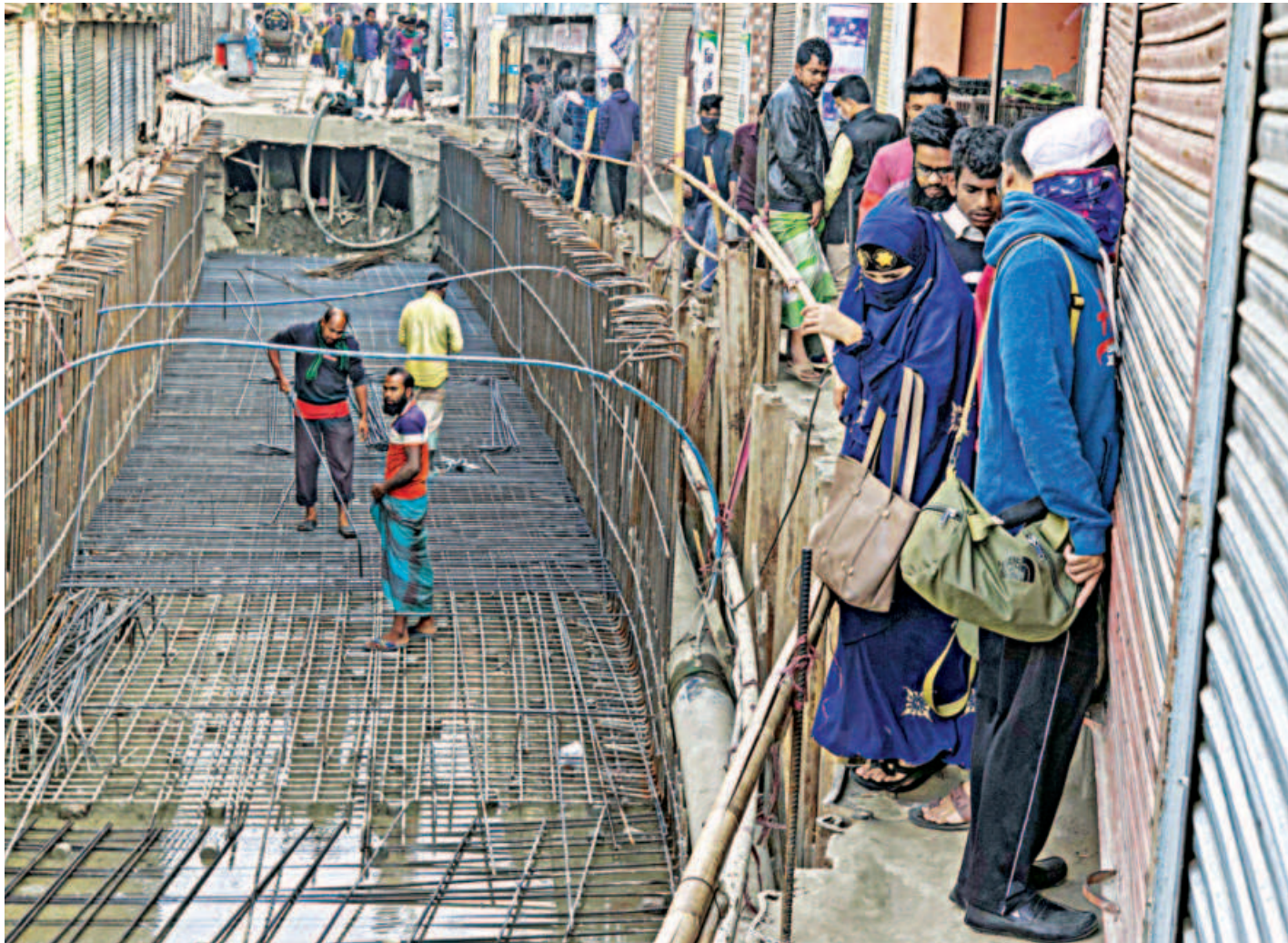
People facing difficulties crossing Chattogram city's Shantibagh area as a box culvert is being constructed without any alternative for people to cross the area smoothly. The culvert is being built for around two years under a project to address waterlogging in the port city. The photo was taken on Wednesday.