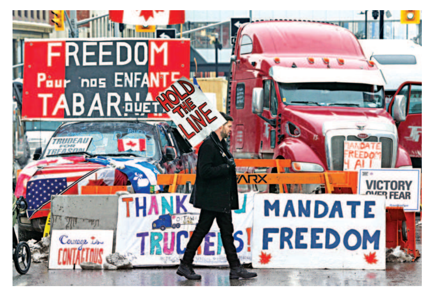
A protester walks in front of parked trucks as demonstrators continue to protest the vaccine mandates implemented by Prime Minister Justin Trudeau in Ottawa, Canada, on Tuesday. Canada's Saskatchewan province announced Tuesday the lifting of all Covid restrictions including wearing of masks and proof of vaccination for indoor dining.

However, he insisted that Washington's "pivot" to the Asia-Pacific region in the face of China's challenge is still alive, despite the powerful diversions of crises in the Middle East and now Eastern Europe in recent years.